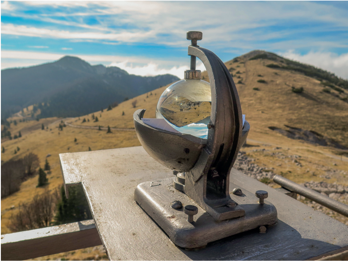
Fig. 5.1 for Question 5