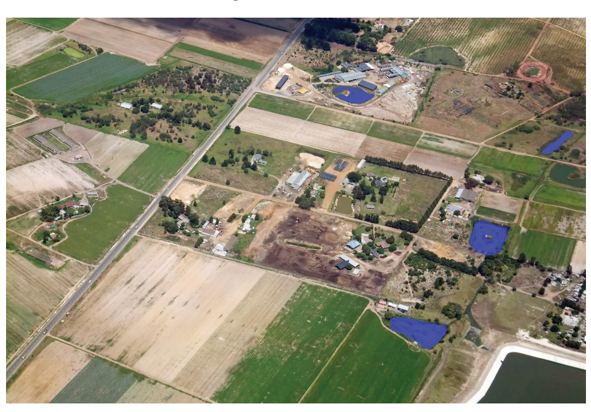
Fig. 6.2 for Question 6