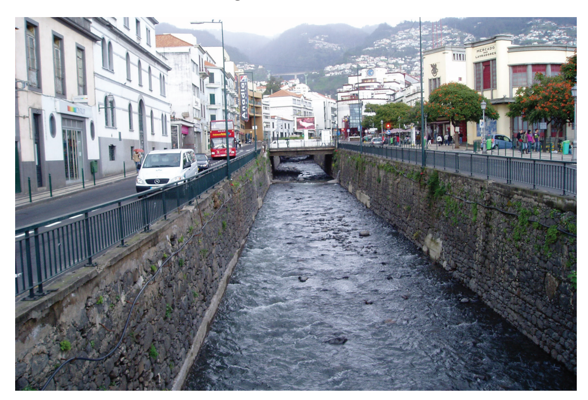
Fig. 4.1 for Question 4