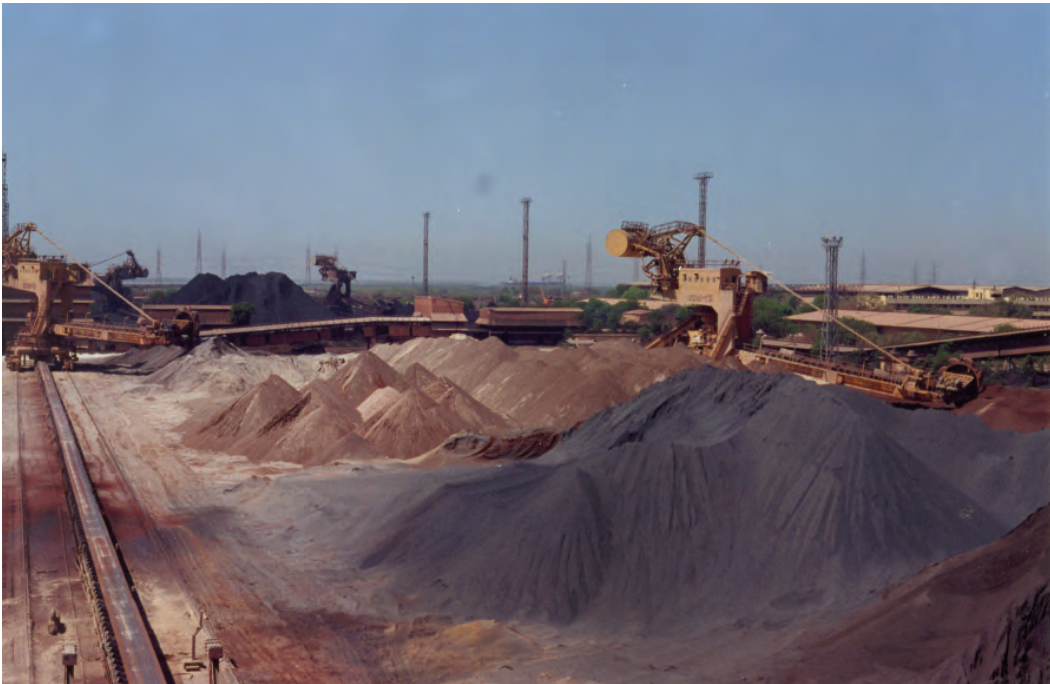
Photograph C for Question 4