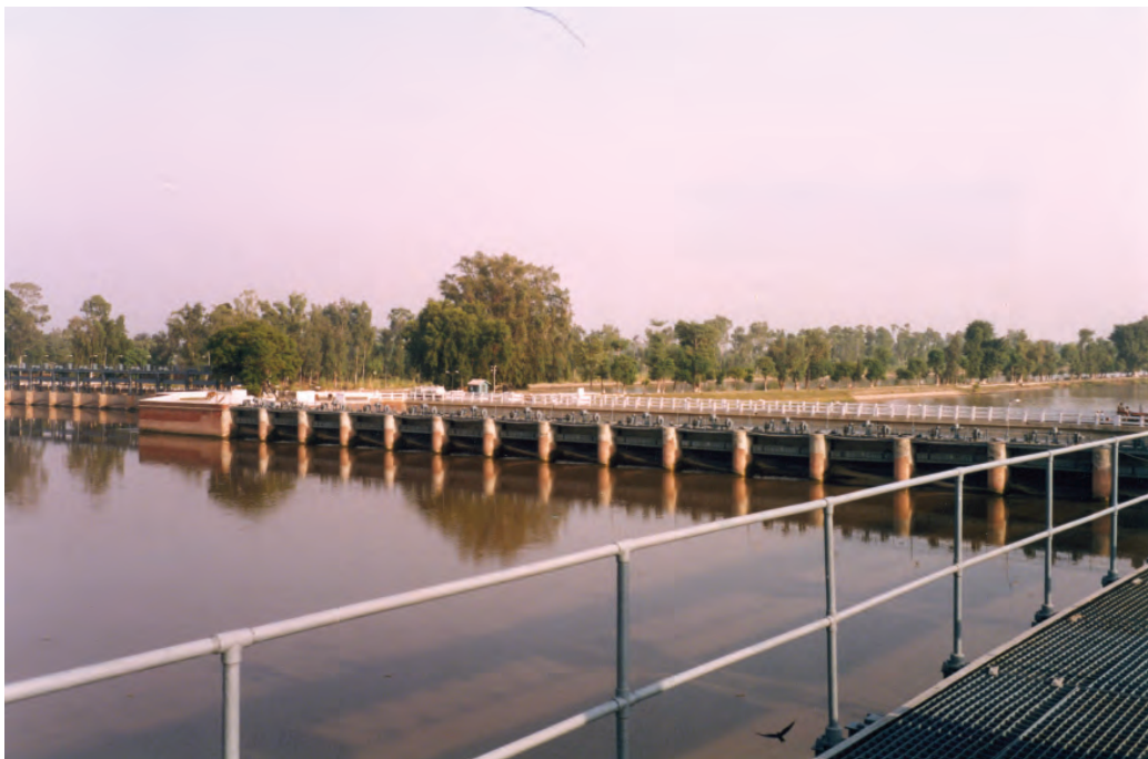
Photograph B for Question 1