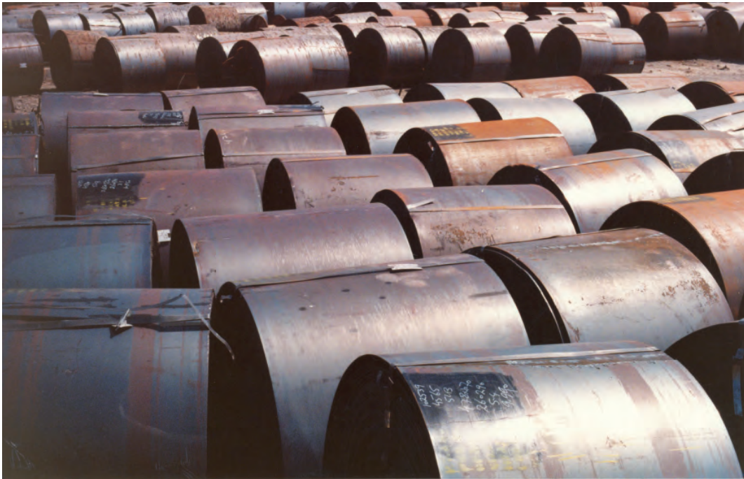
Photograph E for Question 4