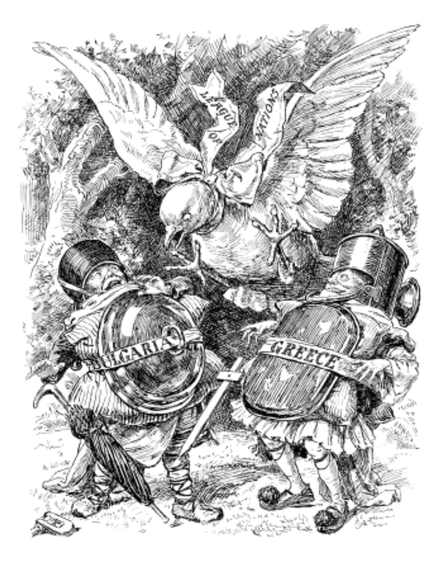
"JUST THEN CAME DOWN A MONSTROUS DOVE WHOSE FORCE WAS PUBLLY MORAL, WHICH TURNED THE HEROES' HEARTS TO LOVE AND MADE THEM DROP THEIR QUARREL."

A British cartoon published in November 1925.