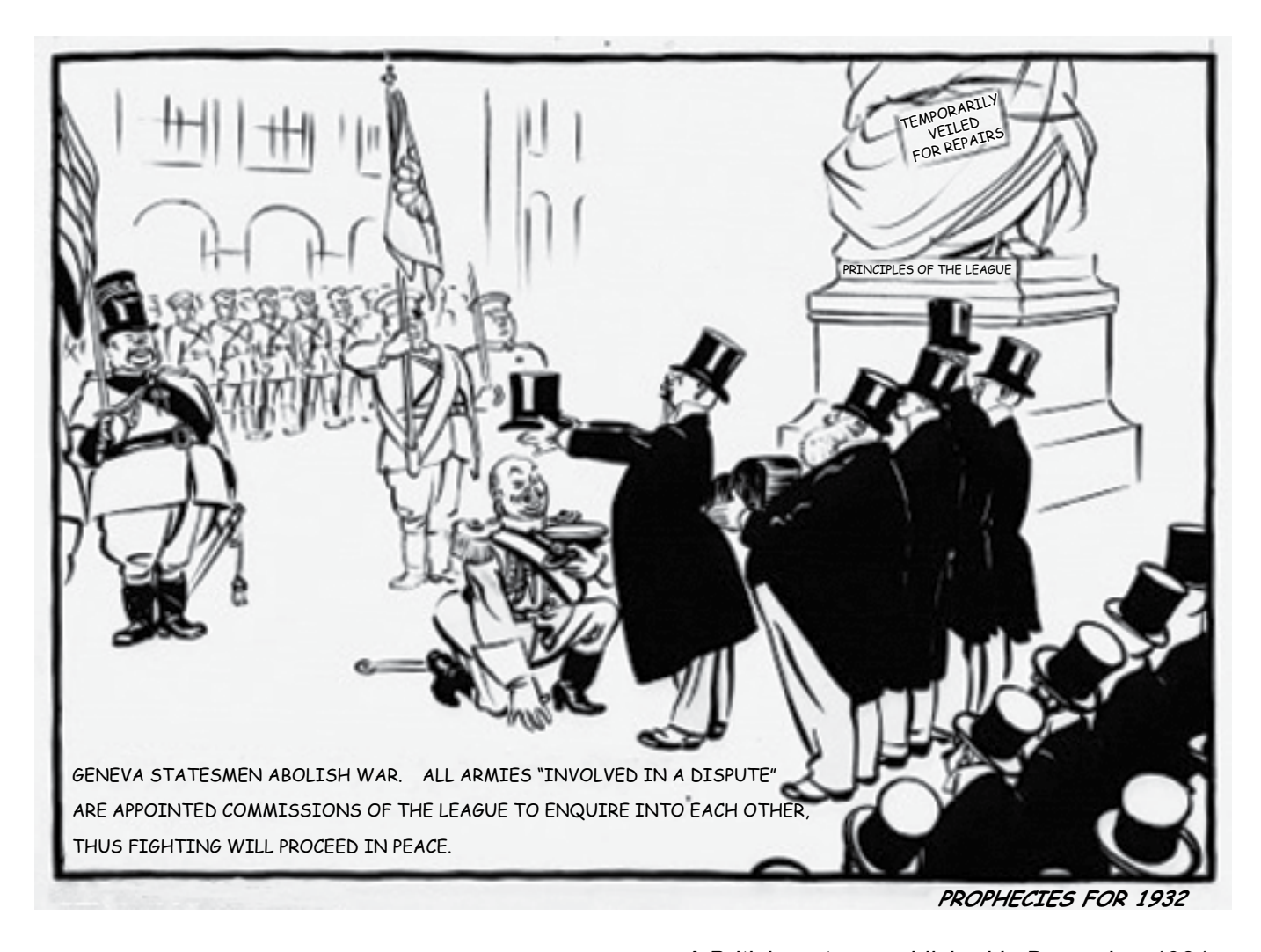
A British cartoon published in December 1931.