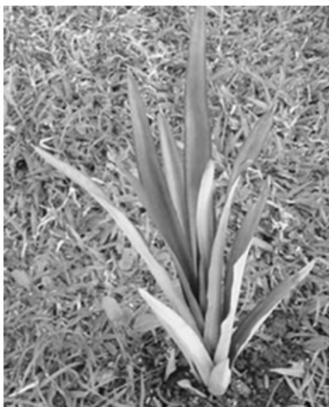
Magnification \times 0.1

2 The photograph below shows a curaua plant.