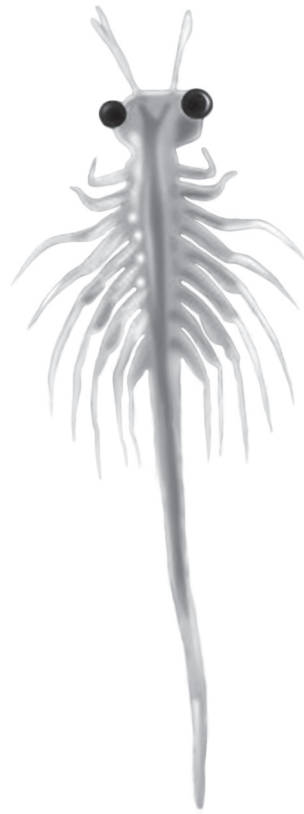
Magnification \times 10

3 The photograph below shows an adult brine shrimp.