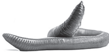
Magnification \times 0.5

Earthworms live in soil and feed on organic matter. Earthworms display a rapid reflex action to retreat from predators.