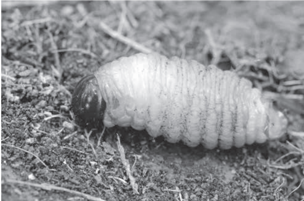
Magnification \times 10

The photograph below shows a larva of R. ferrugineus .