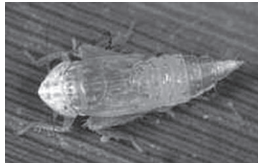
Magnification \times 10

Plan an investigation to determine the effectiveness of wolf spiders, bred in the laboratory, in the control of leafhopper nymphs in rice fields.