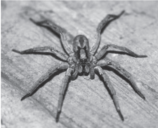
Magnification \times 1