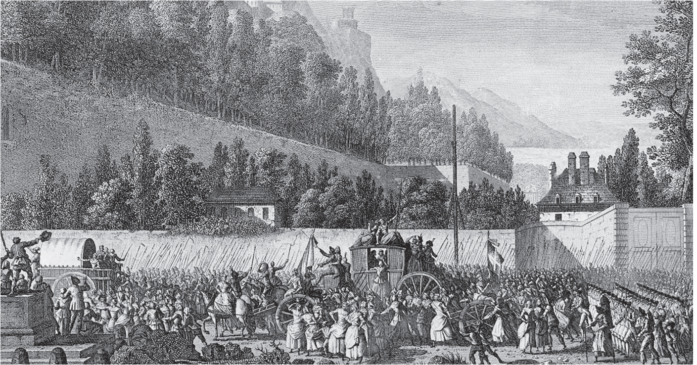
A contemporary illustration of the return of the King to Paris on 6 October 1789.