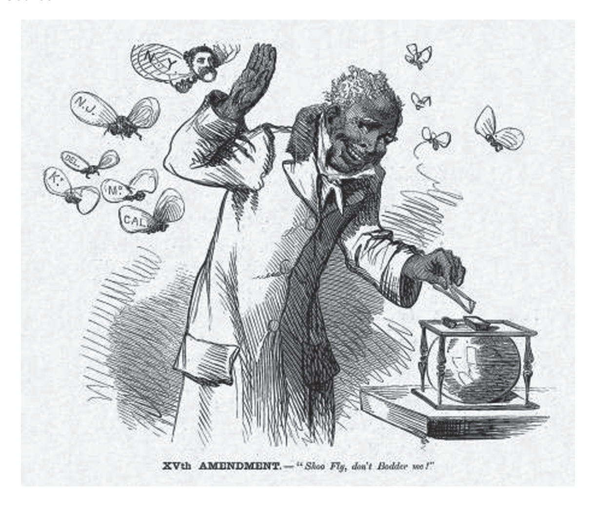
A cartoon from 'Harper's Weekly', published March 1870. The black voter shoos away the irritating 'flies' of states which voted against ratification of the 15th Amendment.

Answer both parts of the question with reference to the sources.