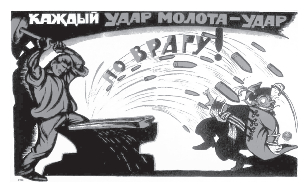
A Bolshevik poster published in 1920. The caption reads 'Every Blow of the Hammer is a Blow Against the Enemy!'

Answer both parts of the question with reference to the sources.