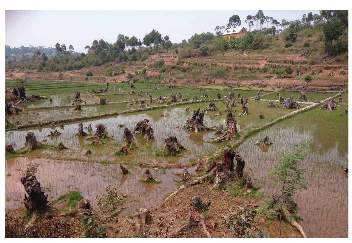
Fig. 5.2 for Question 5