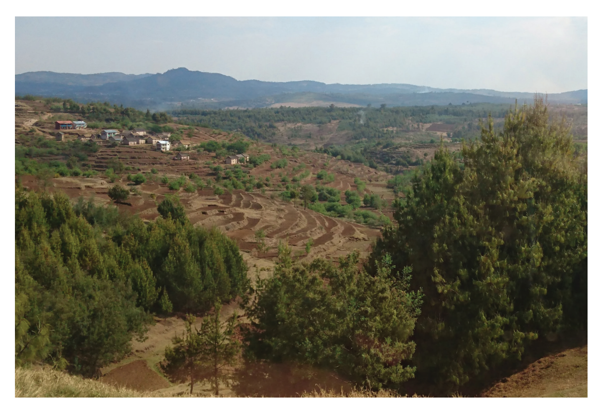
Fig. 5.1 for Question 5