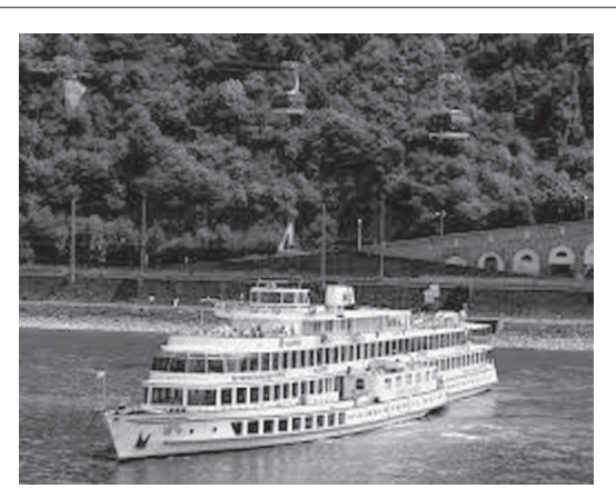
Fig. 2.1 for Question 2