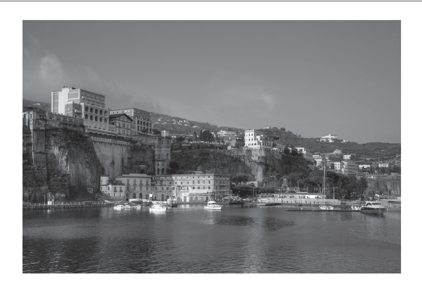
Fig. 1 for Question 1