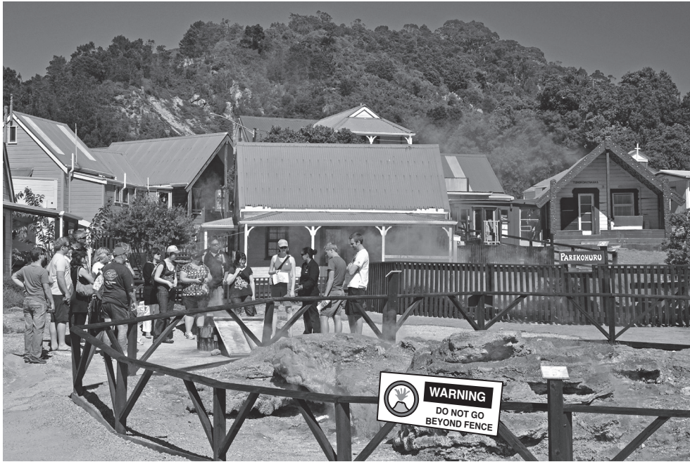
A group of tourists viewing a geothermal vent as part of a guided tour.