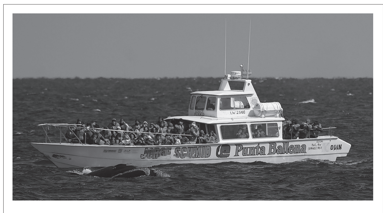
Fig. 3 for Question 3

Wildlife tours are popular with tourists. The photograph above shows a whale watching tour in Argentina.