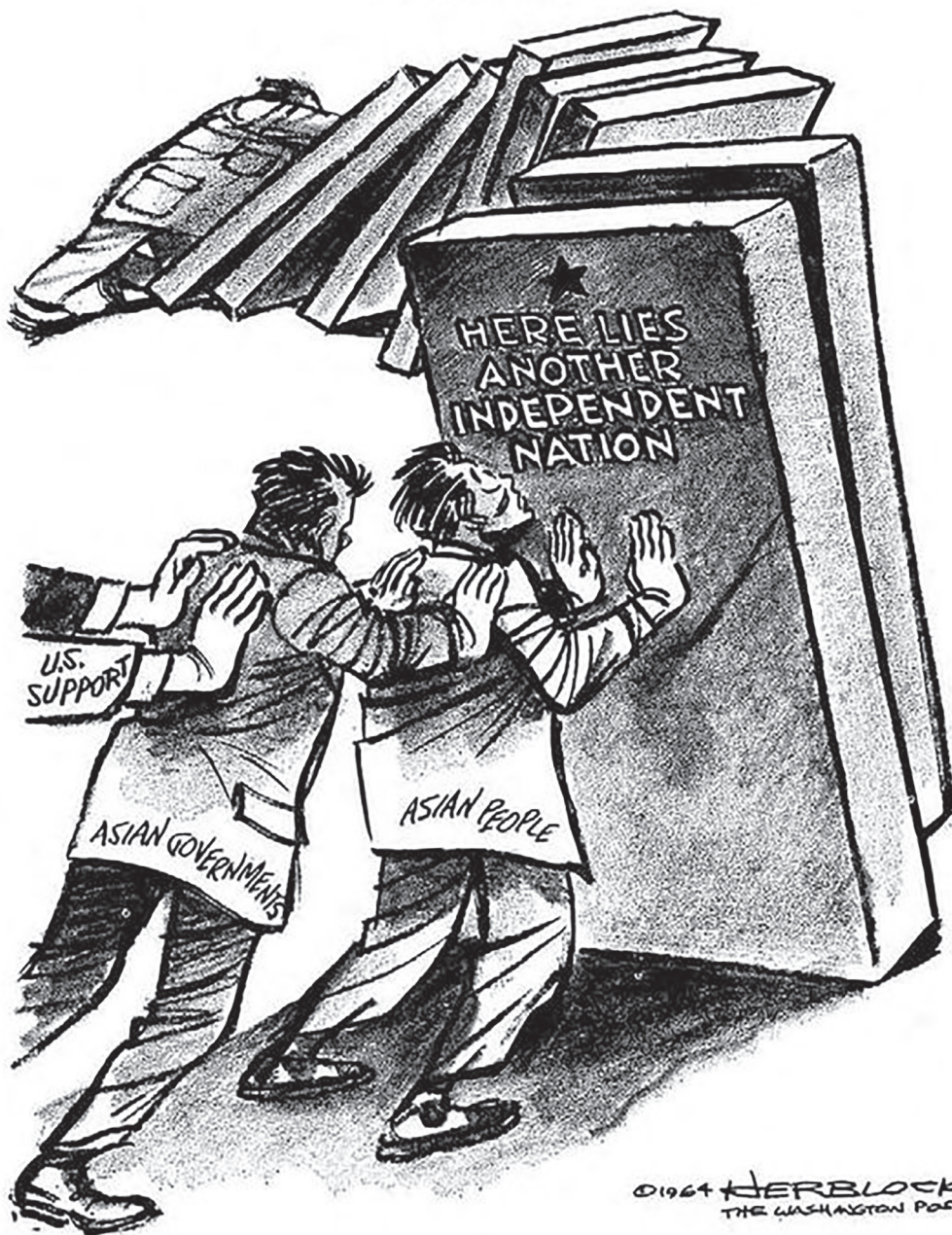
A cartoon published in the United States in May 1964.