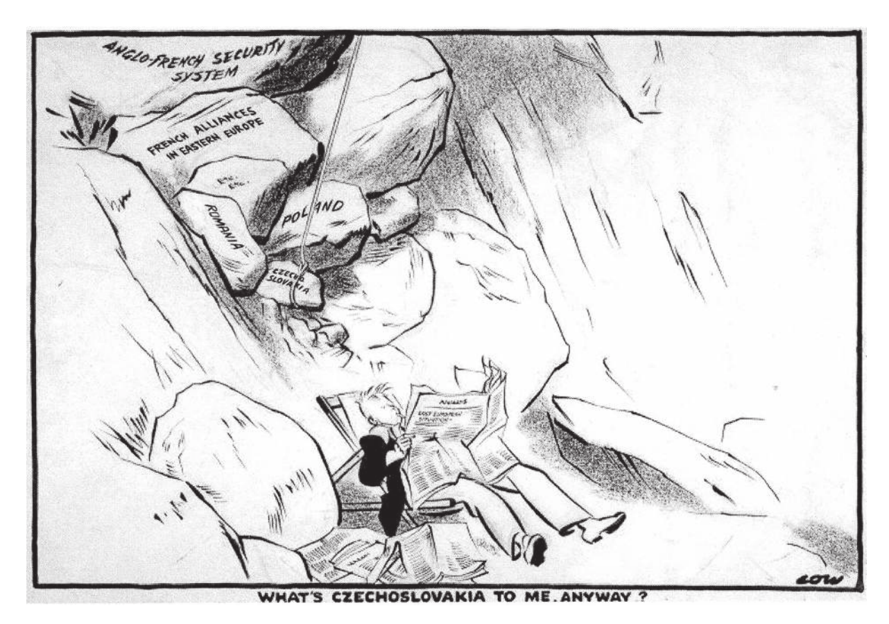
A British cartoon published in July 1938.