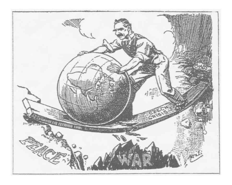
A British cartoon published on 25 September 1938.