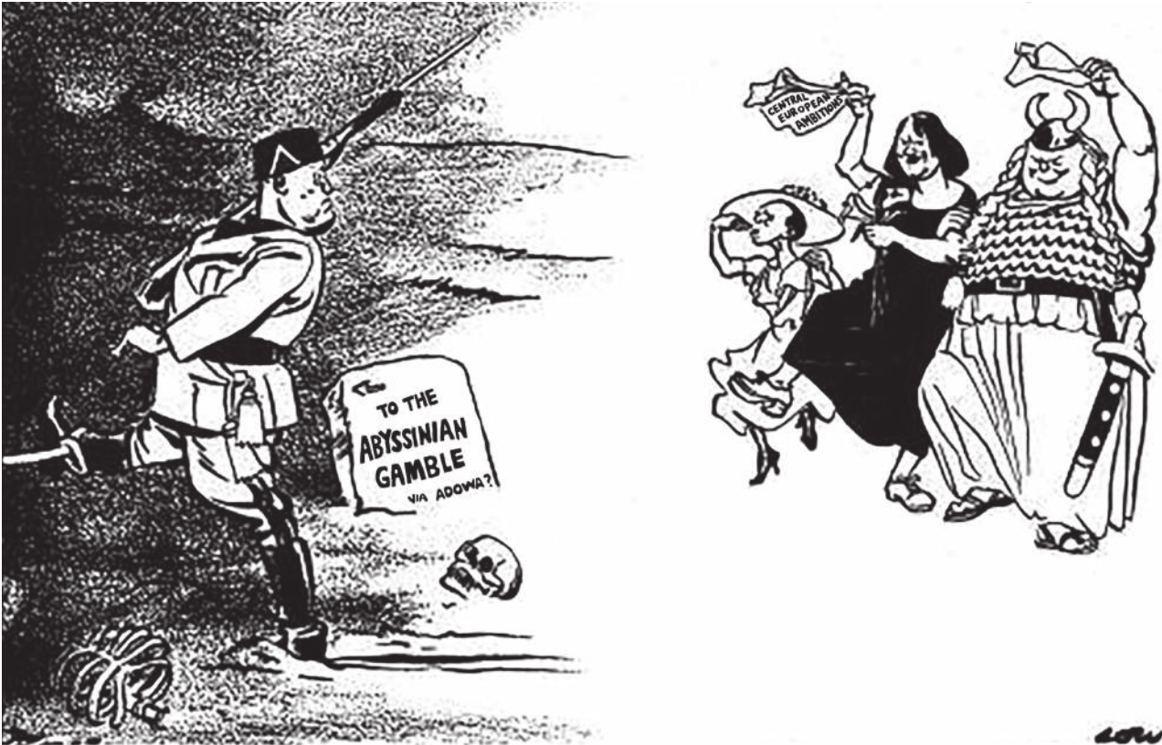
THE GIRLS HE LEFT BEHIND HIM

A British cartoon published in May 1935. The figures on the right are Goebbels, Hitler and Göring.