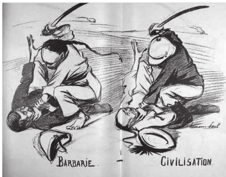
A cartoon about the Boxer Rebellion published in a French magazine, July 1899. 'Barbarie' means 'Barbarism'.