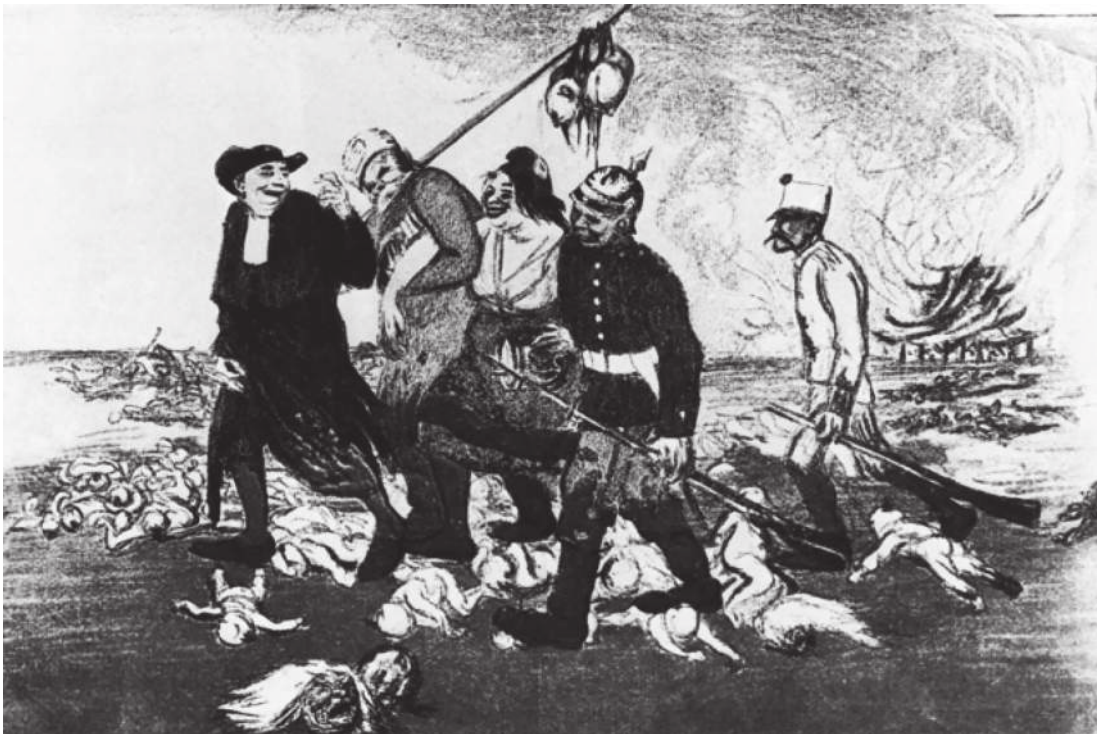
A cartoon published in a French magazine, July 1900. Its title is 'The expedition of the European powers against the Boxers'.