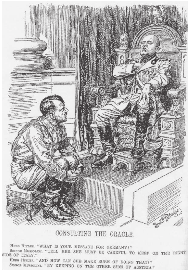
A British cartoon published in June 1934. An oracle is a person who gives wise advice.