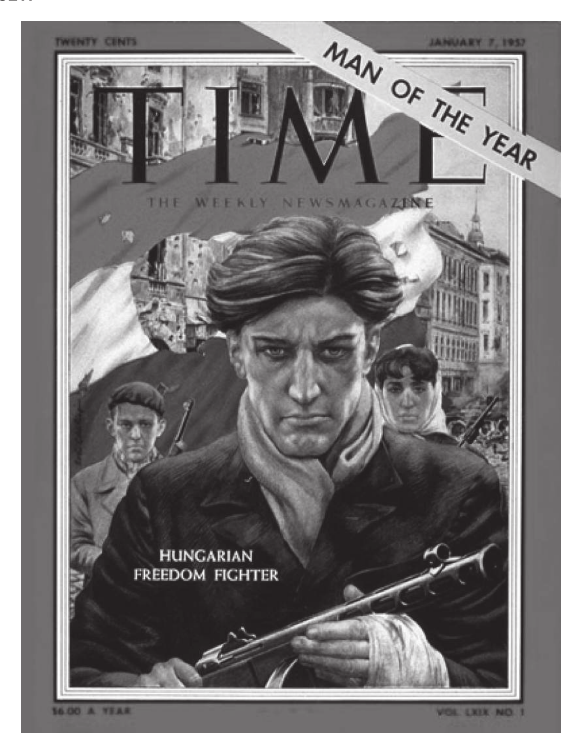
The cover of an American magazine, January 1957.