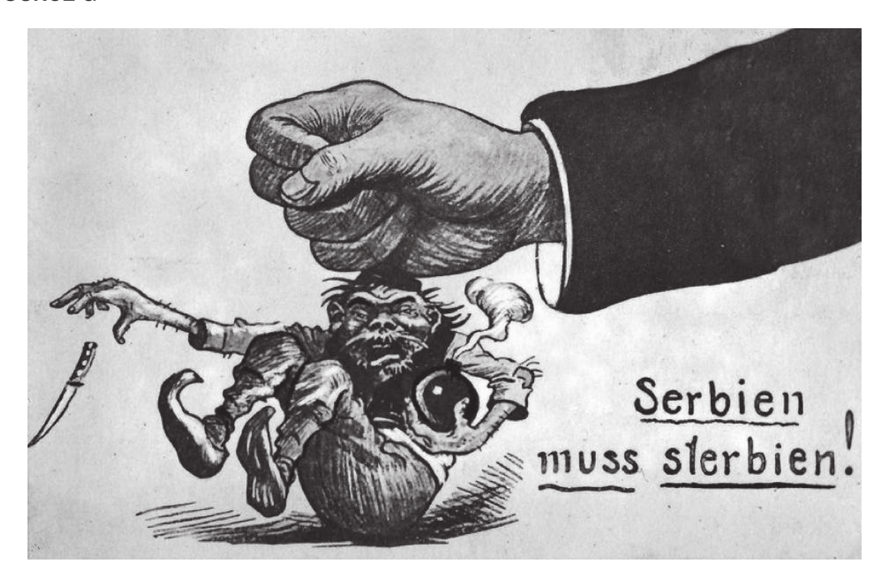
A postcard published in Austria in 1914 soon after the assassination of Franz Ferdinand. The words in the bottom right say 'Serbia must die!'