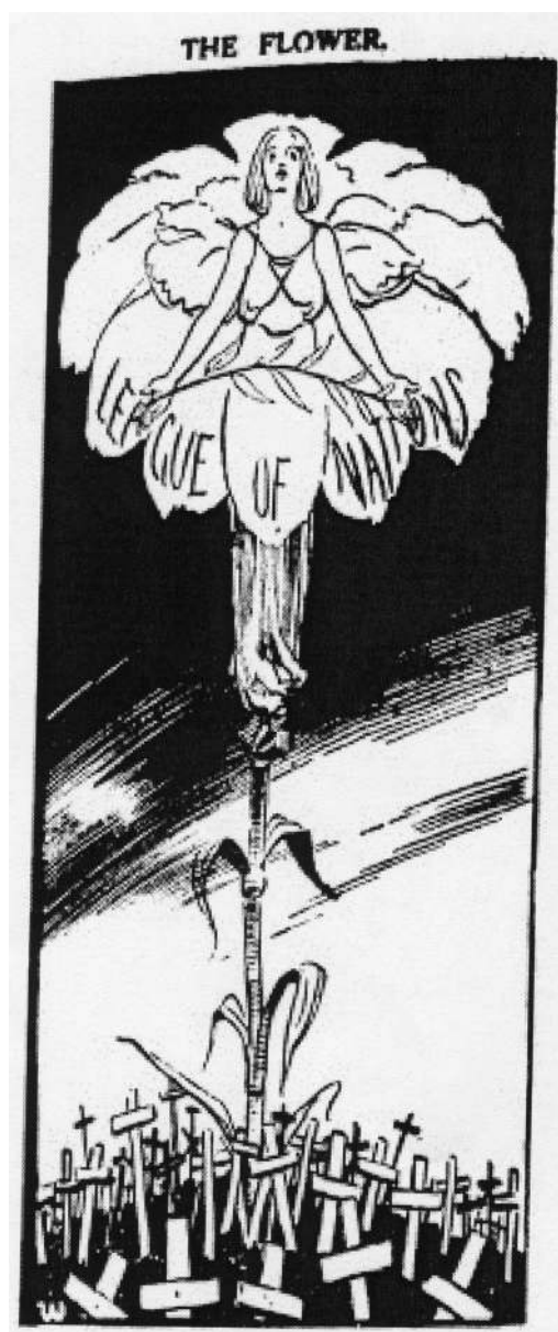
A British cartoon published in November 1919.