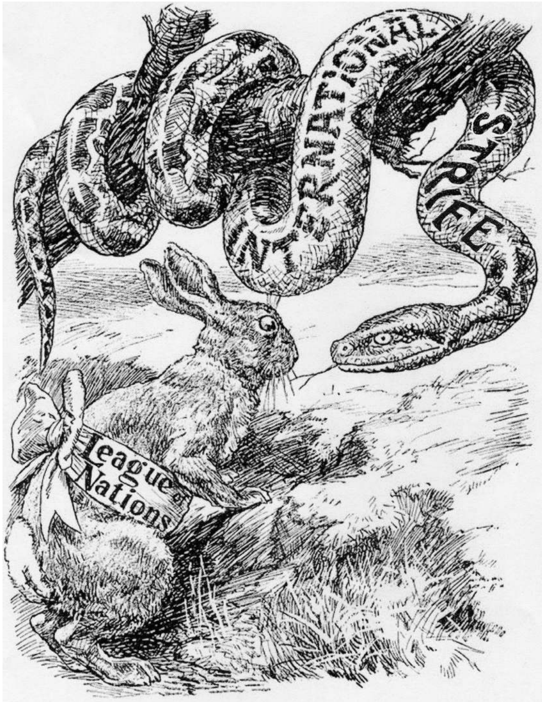
A British cartoon entitled 'Moral Persuasion', published in 1920. The rabbit is saying 'My offensive equipment being practically nil, it remains for me to fascinate him with the power of my eye.'