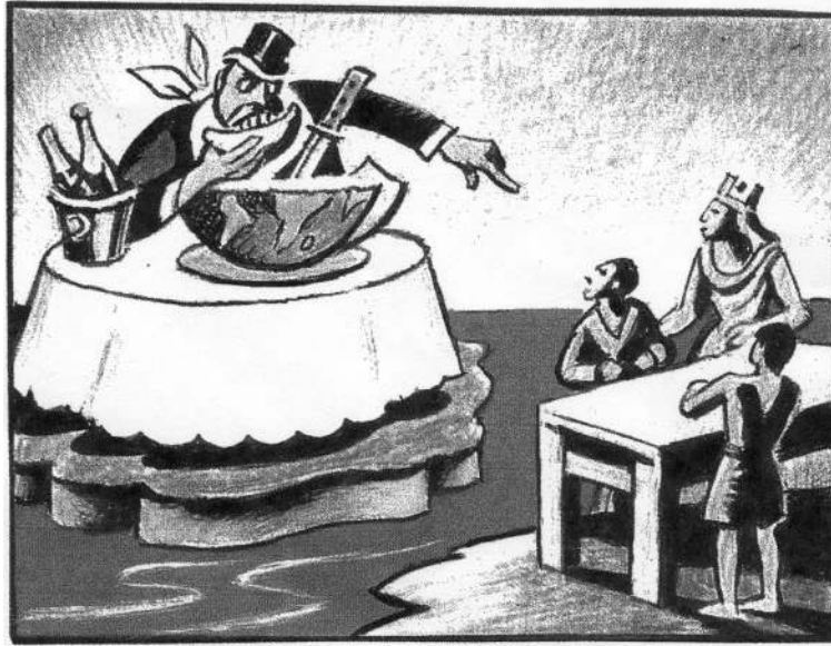
An Italian cartoon showing Britain (top left) criticising Italy (bottom right) over Abyssinia. This cartoon was published in October 1935 in a newspaper founded by Mussolini.