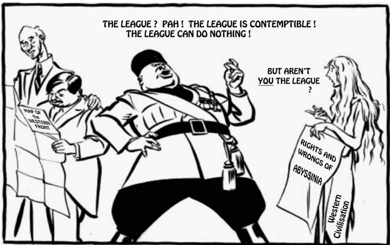
A British cartoon published in February 1935.