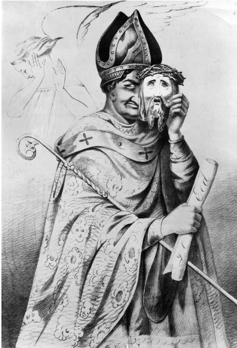
A cartoon of Pope Pius IX published in 1852. He is holding a mask of Christ.