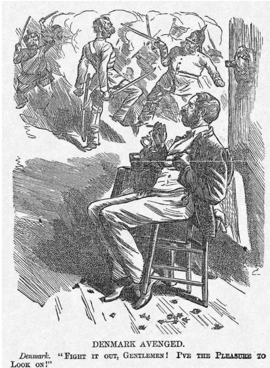
An American cartoon, August 1866.