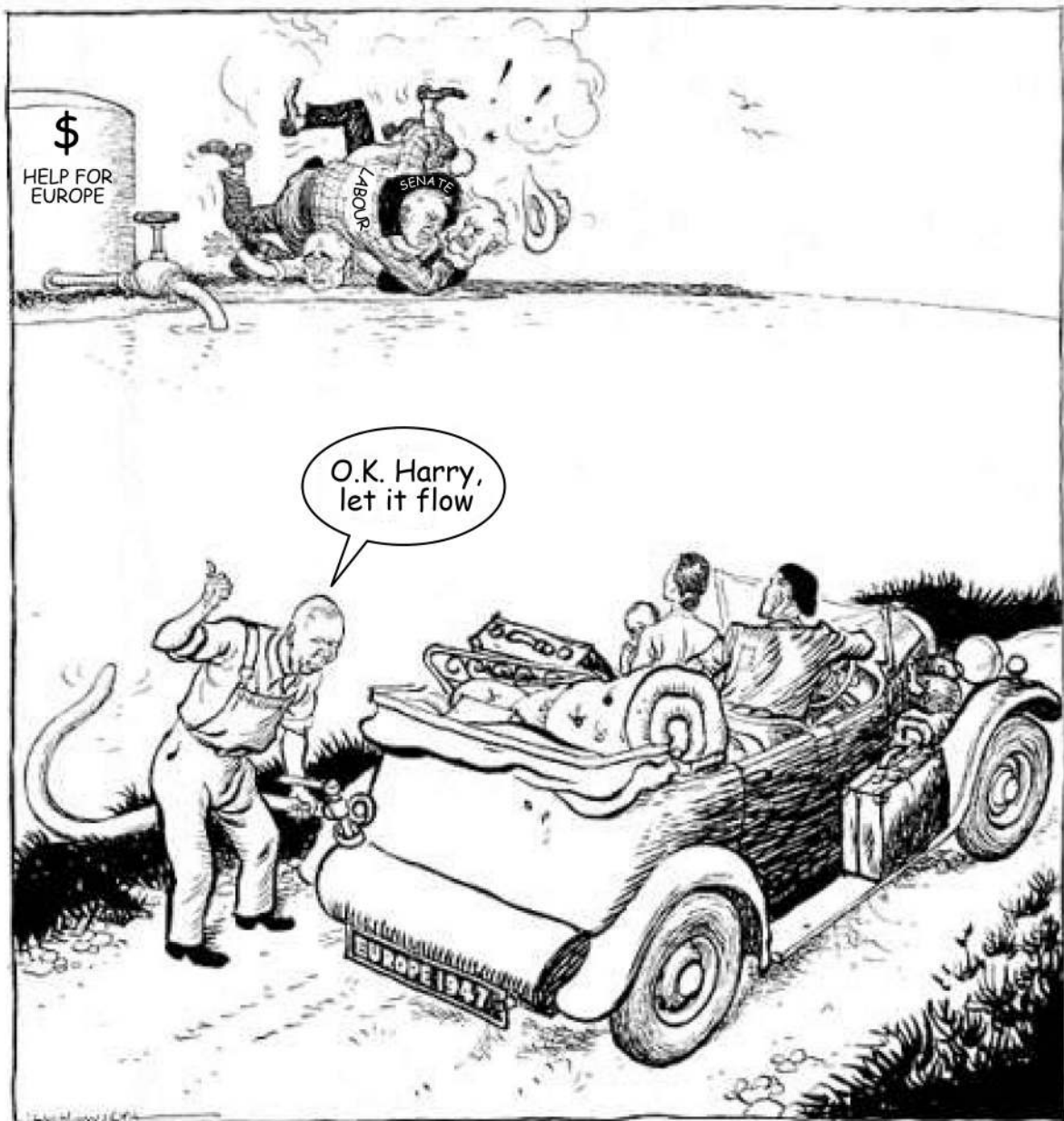
A cartoon published in Britain, June 1947. Marshall is speaking to Truman, who is held down by his opponents.