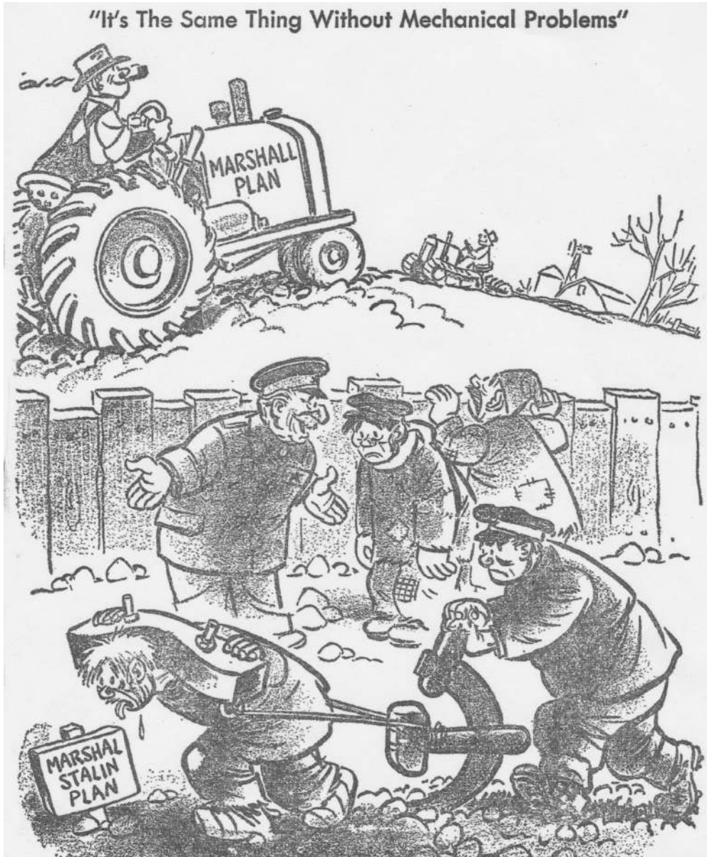
A cartoon published in the USA, January 1949.