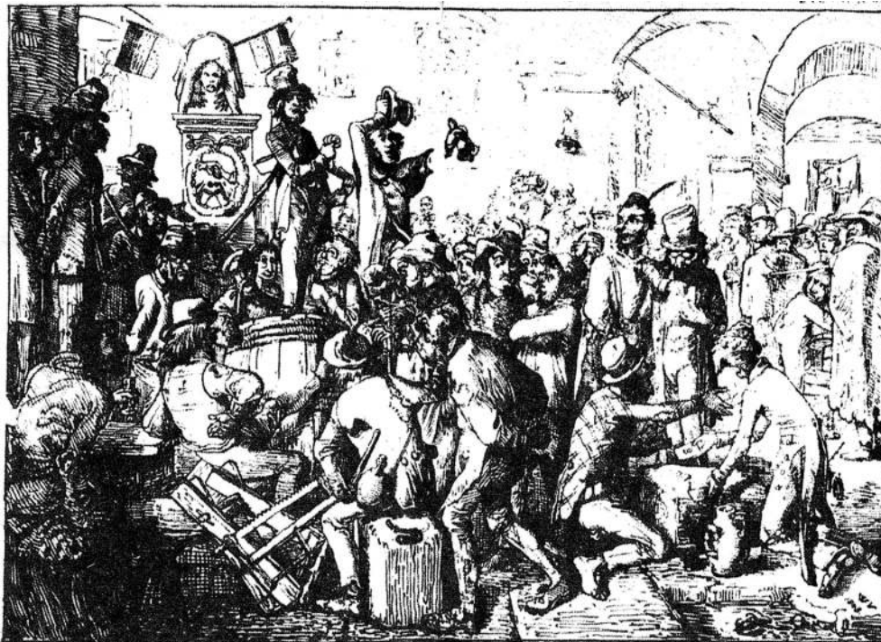
A cartoon published in Germany in 1848 entitled 'Parliament of the future'.