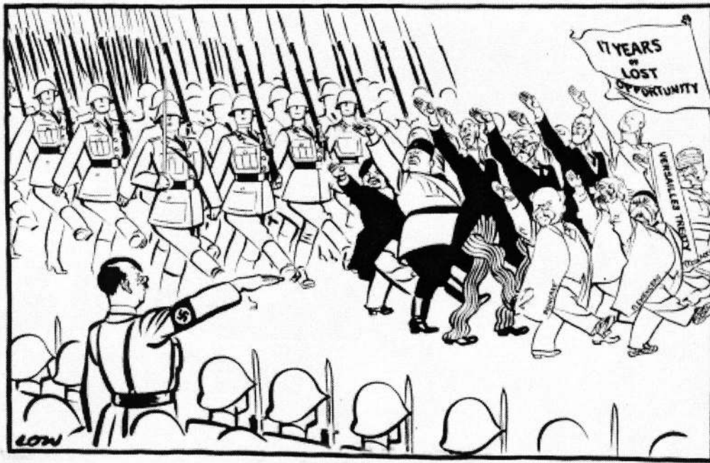
A cartoon, entitled 'Cause Precedes Effect', published in a British newspaper, 1935. It shows a parade of world statesmen led by the Versailles peacemakers.