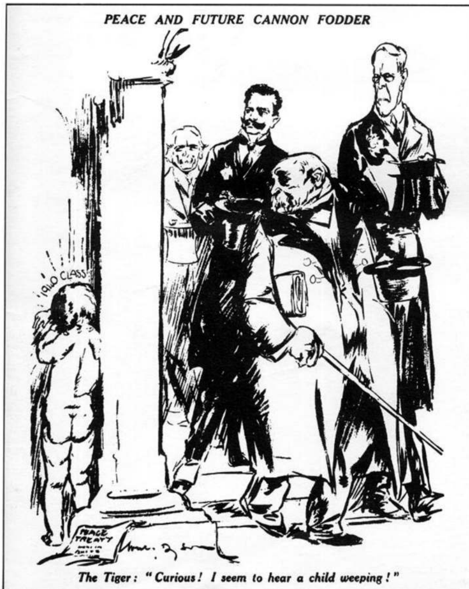
A cartoon published in a British newspaper, May 1919. 'The Tiger' refers to Clemenceau.