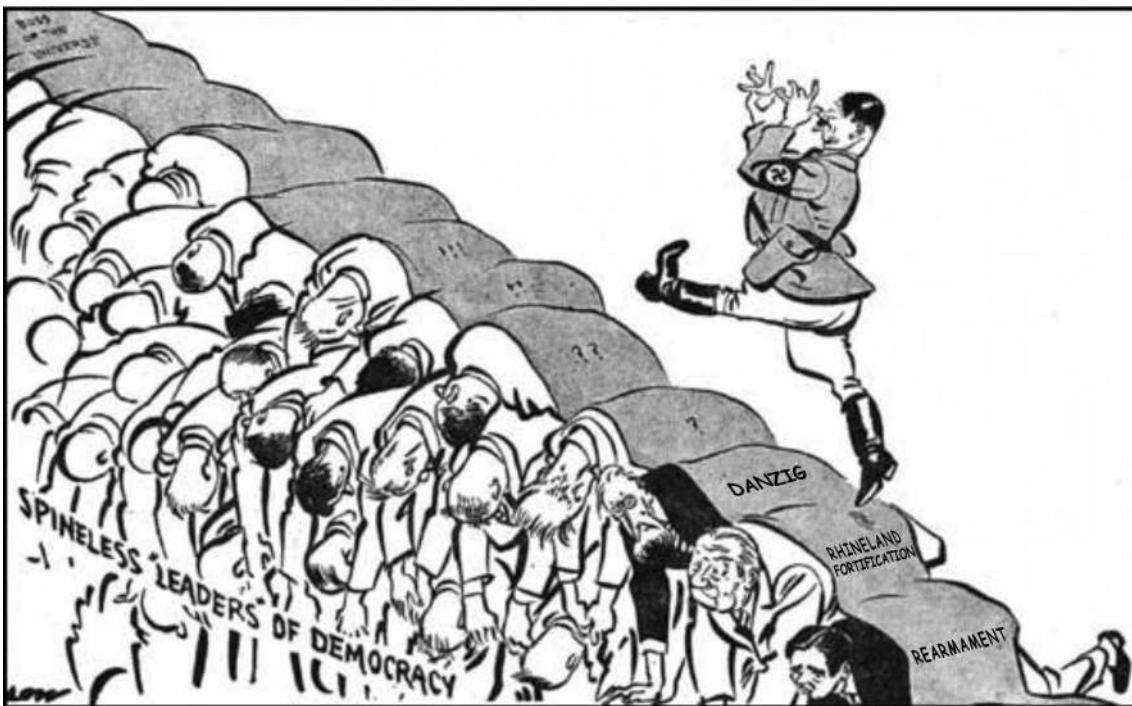
A cartoon, entitled 'Stepping Stones to Glory', published in a British newspaper, July 1936.