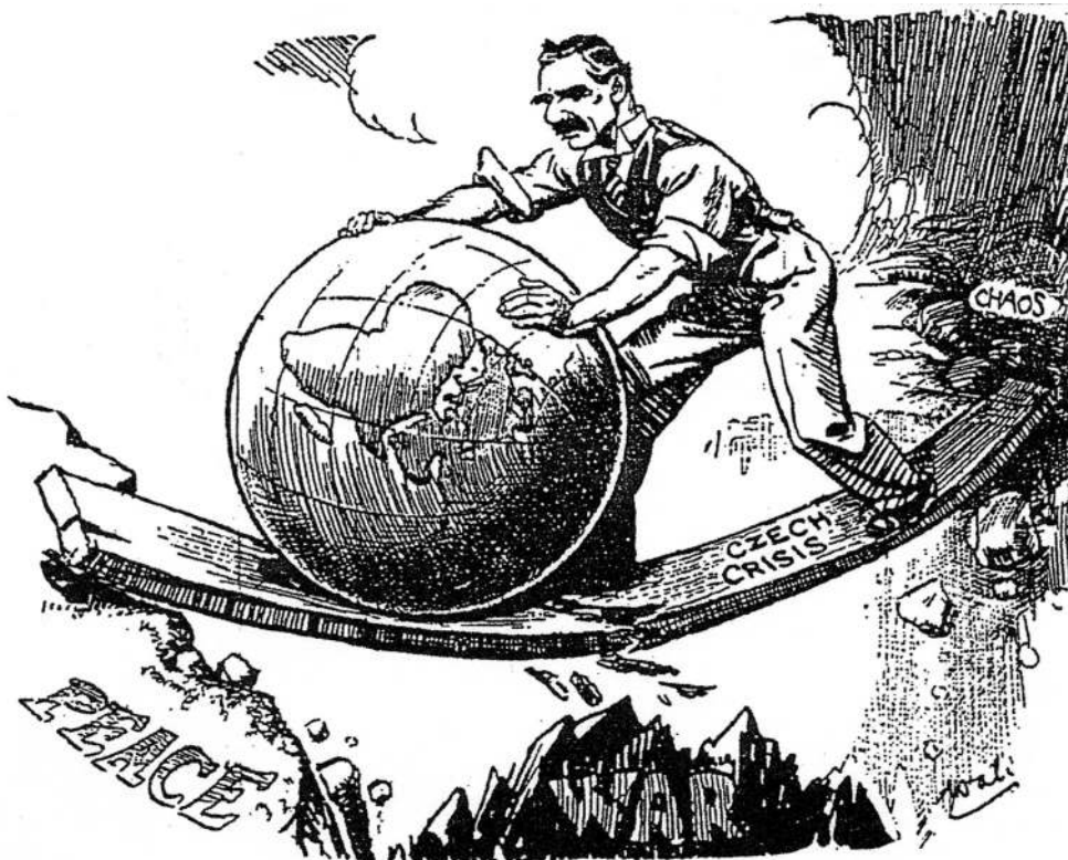
A cartoon published in a British newspaper on 25 September 1938. The man in the cartoon is Chamberlain.