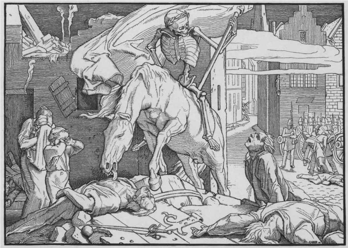
A drawing, from the time, of the disturbances in Berlin. It is entitled 'The Dance of Death, 1848'.