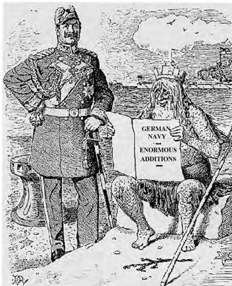
A British cartoon published in 1900. Neptune, god of the sea, is saying 'Have I got to learn German at my time of life?'