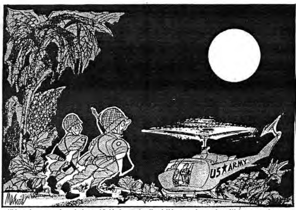
"You know what I dread? If they do find life up there it will be another poor democratic people threatened by the Commies!"

A cartoon published in Britain in 1969. US astronauts landed on the moon for the first time that year.