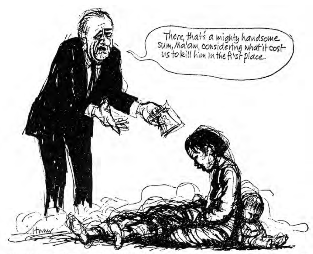
(The US is spending more than $40,000,000 per day on the war in Vietnam; compensation payments for South Vietnamese civilians killed 'by mistake' are $34 per head.)