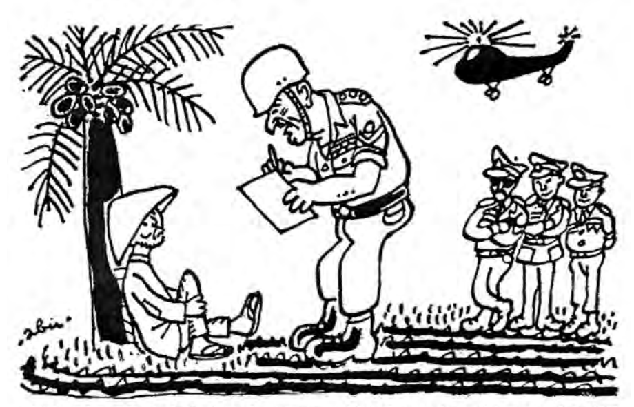
'If there's a general election tomorrow, which General would you vote for?'