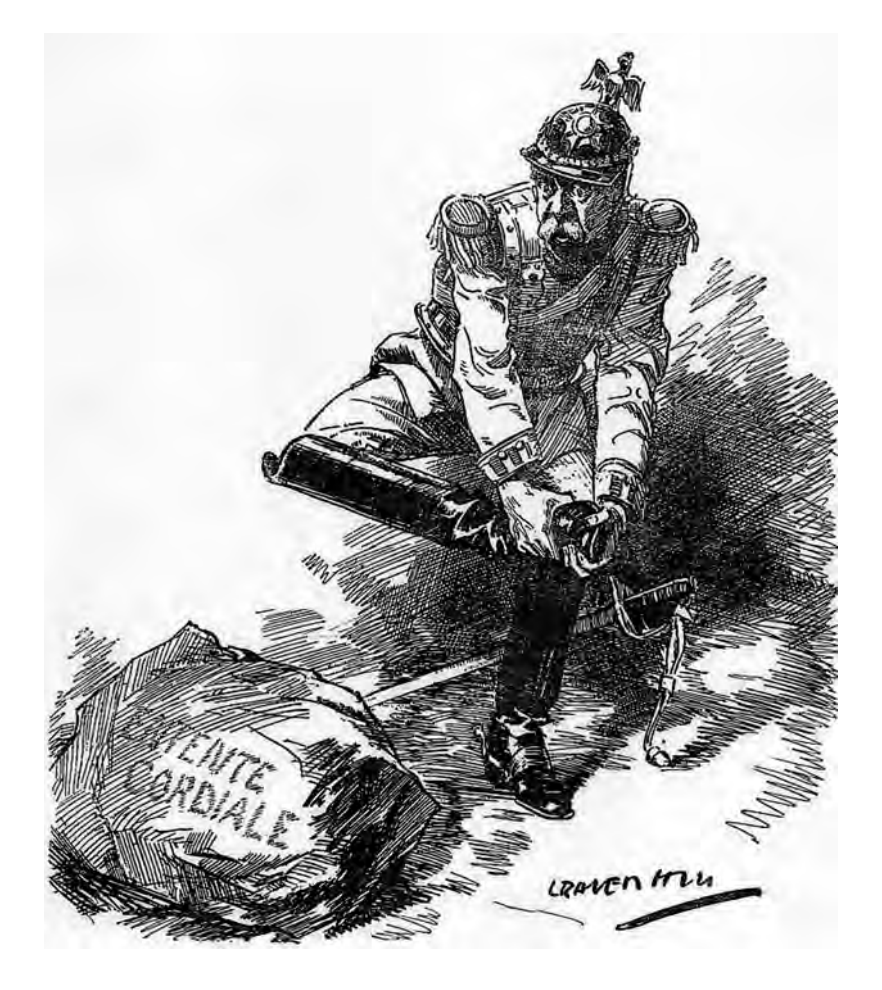
A British cartoon, entitled 'Solid', published in August 1911. The Kaiser is saying 'Donnerwetter! It's rock. I thought it was going to be paper.'