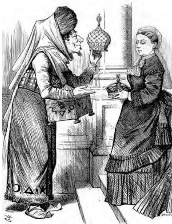
“NEW CROWNS FOR OLD ONES!”

25 Look at the cartoon, and then answer the questions which follow.