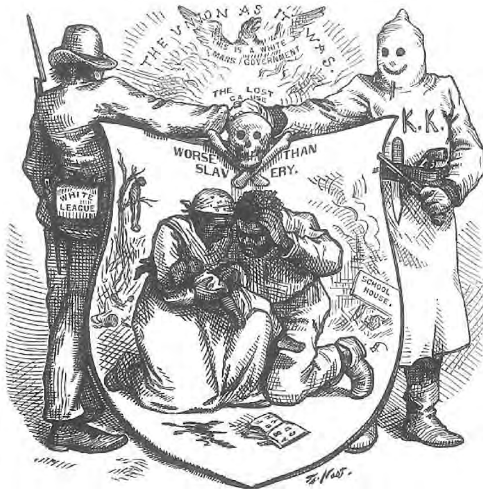
An American cartoon showing the relationship of the White League and the Ku Klux Klan.