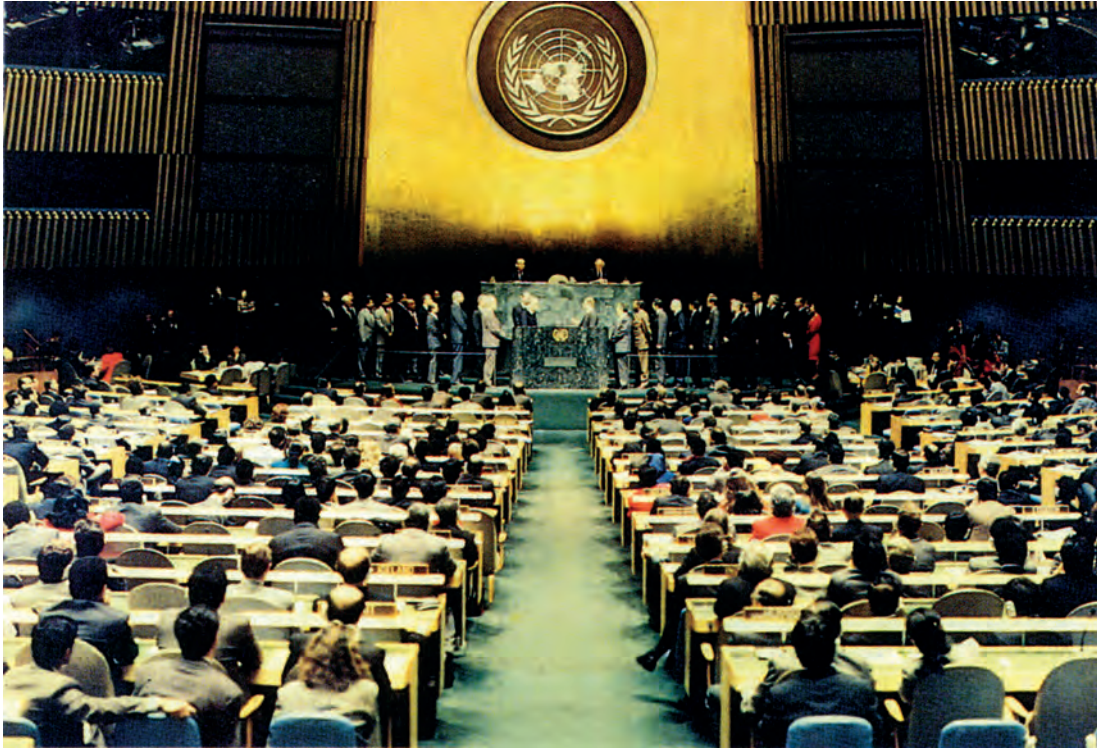
A photograph of the General Assembly of the United Nations in session.