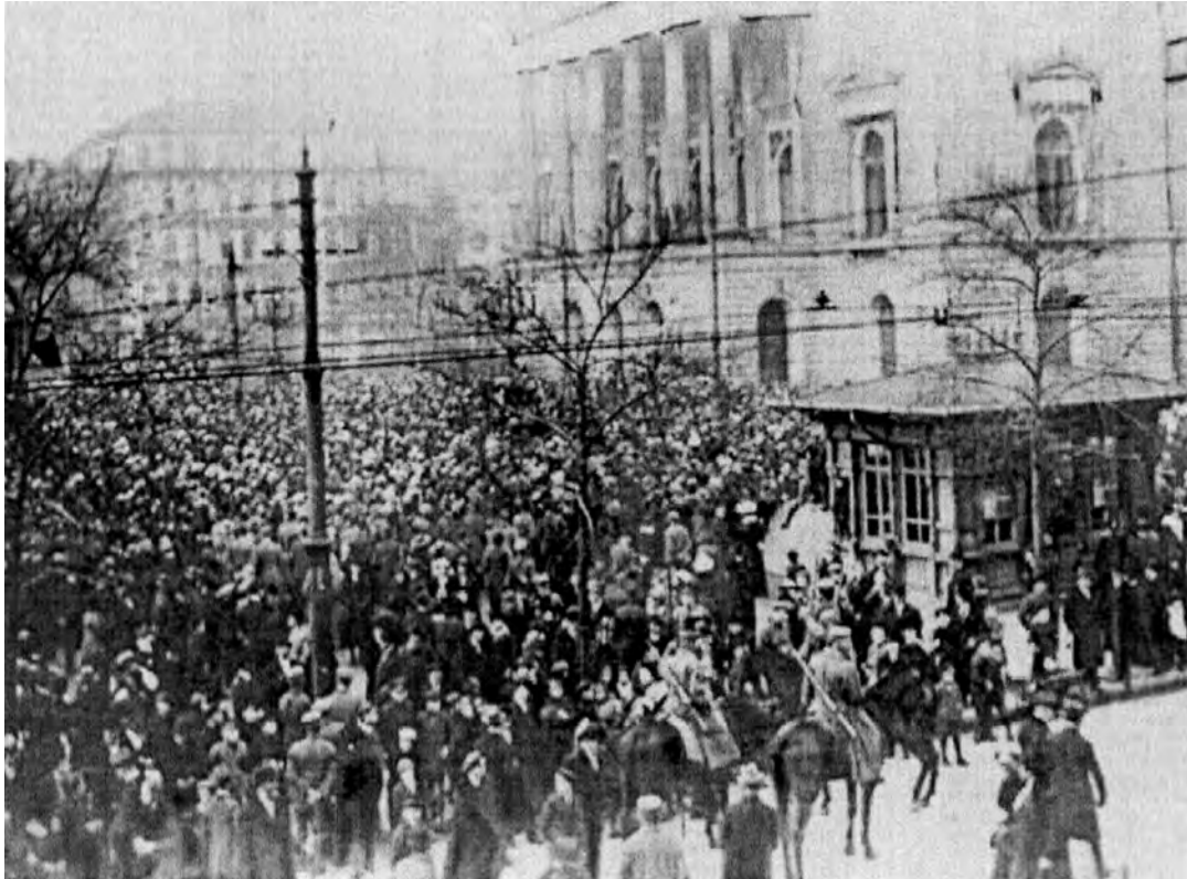
A photograph taken in Berlin in 1920 during the general strike.