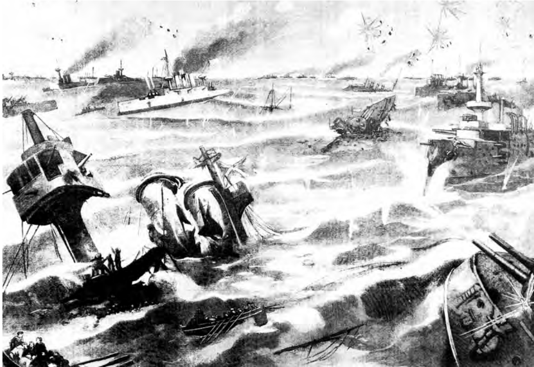
An illustration of the Battle of Tsushima Straits in which the Russian Baltic fleet was destroyed by the Japanese navy in May 1905.