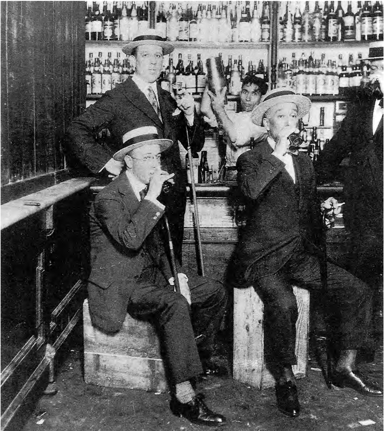
A photograph of a speakeasy.

13 Look at the photograph, and then answer the questions which follow.