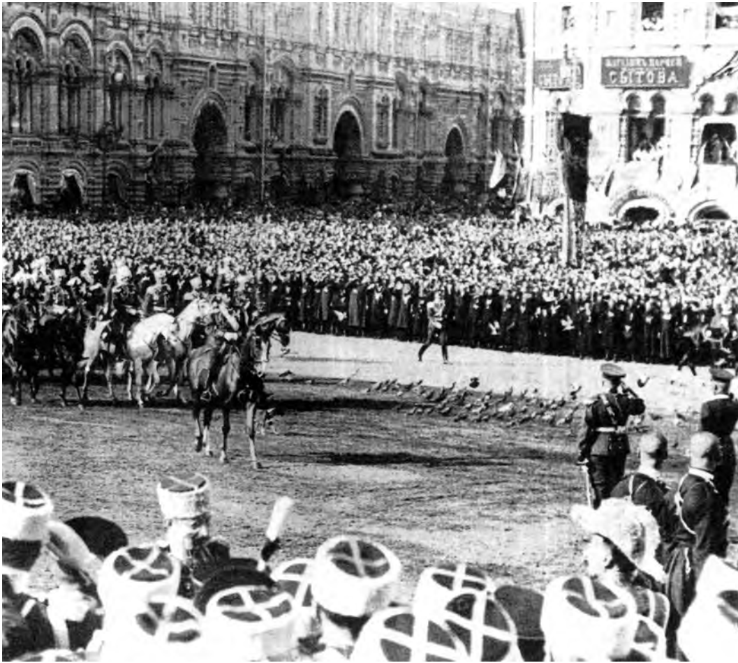
A photograph of Tsar Nicholas II at the 1913 celebrations of 300 years of Romanov rule. This was the first time since 1905 that he had appeared in public.

11 Look at the photograph, and then answer the questions which follow.