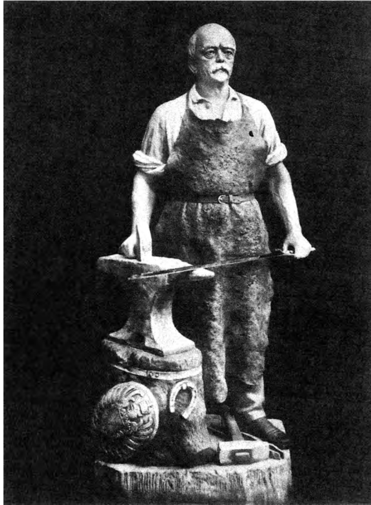
A statue of Bismarck from the 1870s. It shows him making preparations for the unification of Germany.