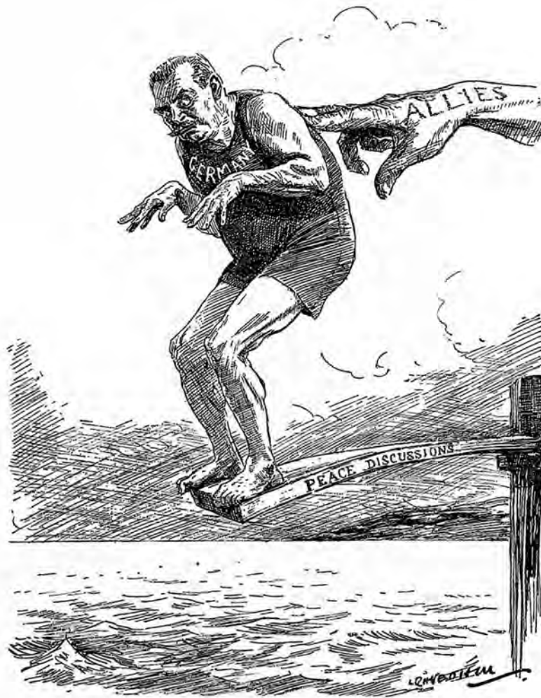
THE FINISHING TOUCH.