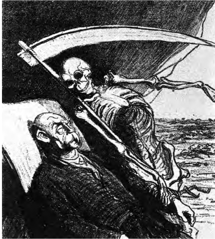
A cartoon from the early 1870s showing Death thanking Bismarck for the thousands killed in the course of unification.