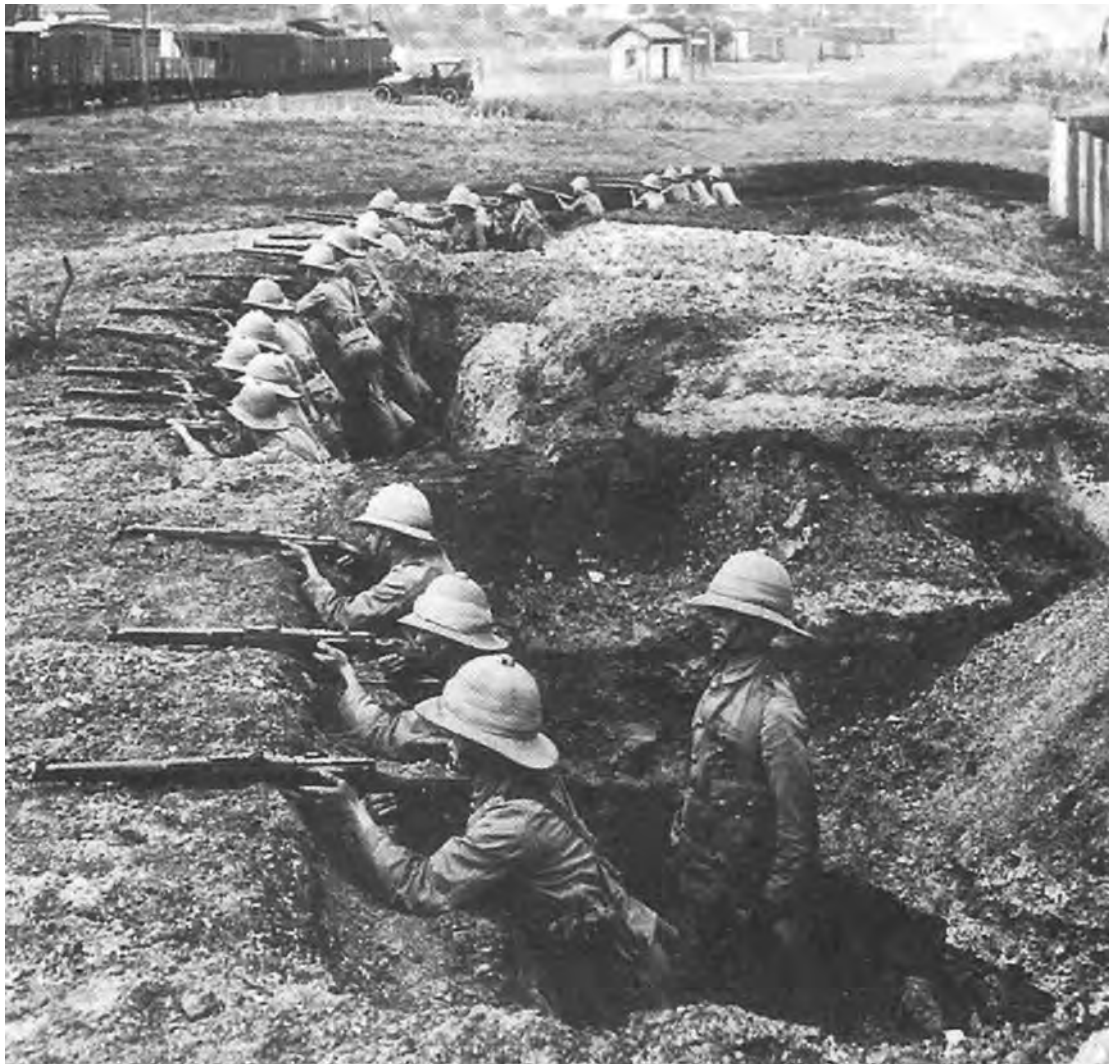
Government soldiers facing striking mine-workers in Johannesburg, 1922.

17 Look at the photograph, and then answer the questions which follow.