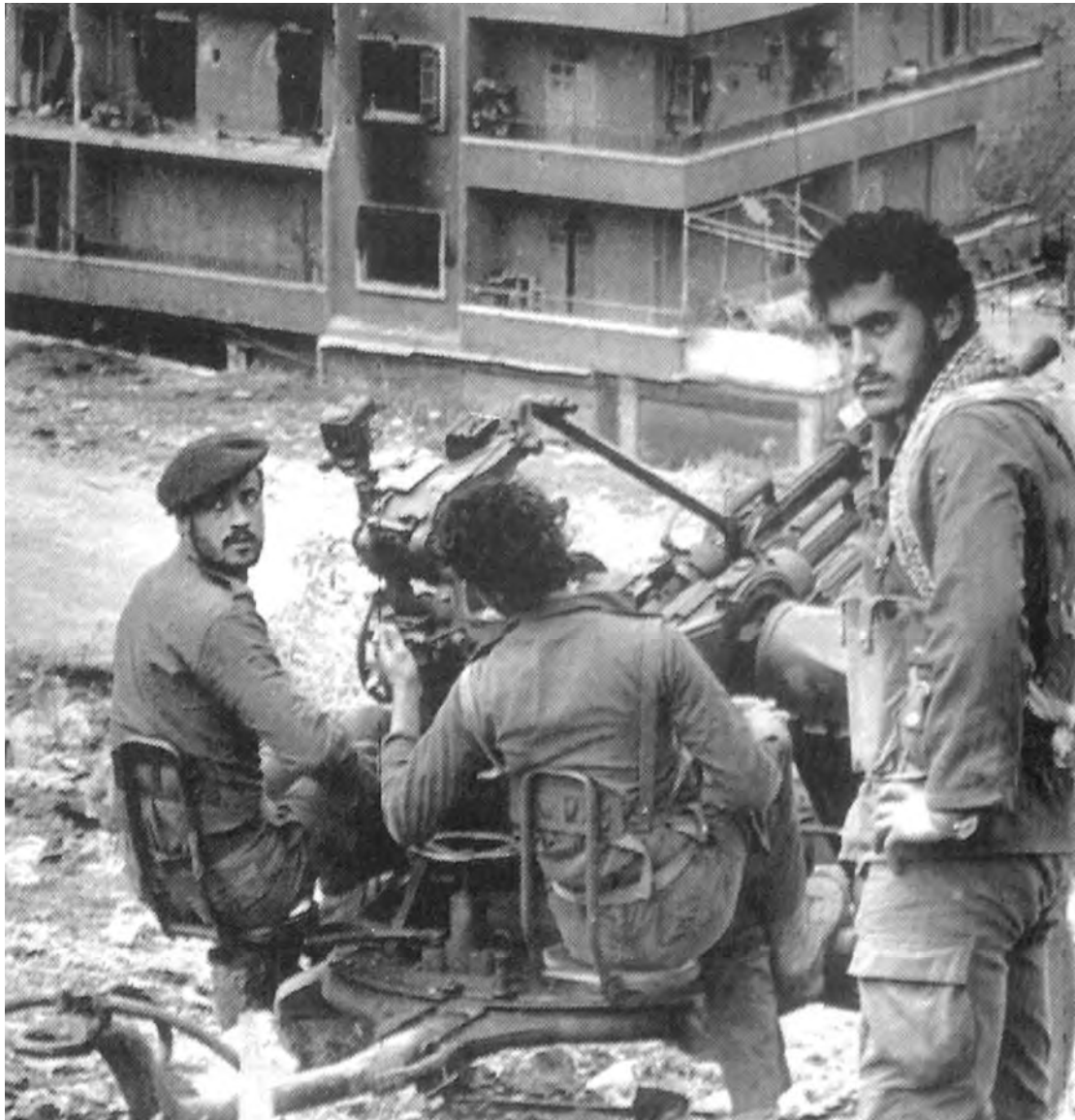
A PLO anti-aircraft gun in Beirut, Lebanon, 1983.

21 Look at the photograph, and then answer the questions which follow.