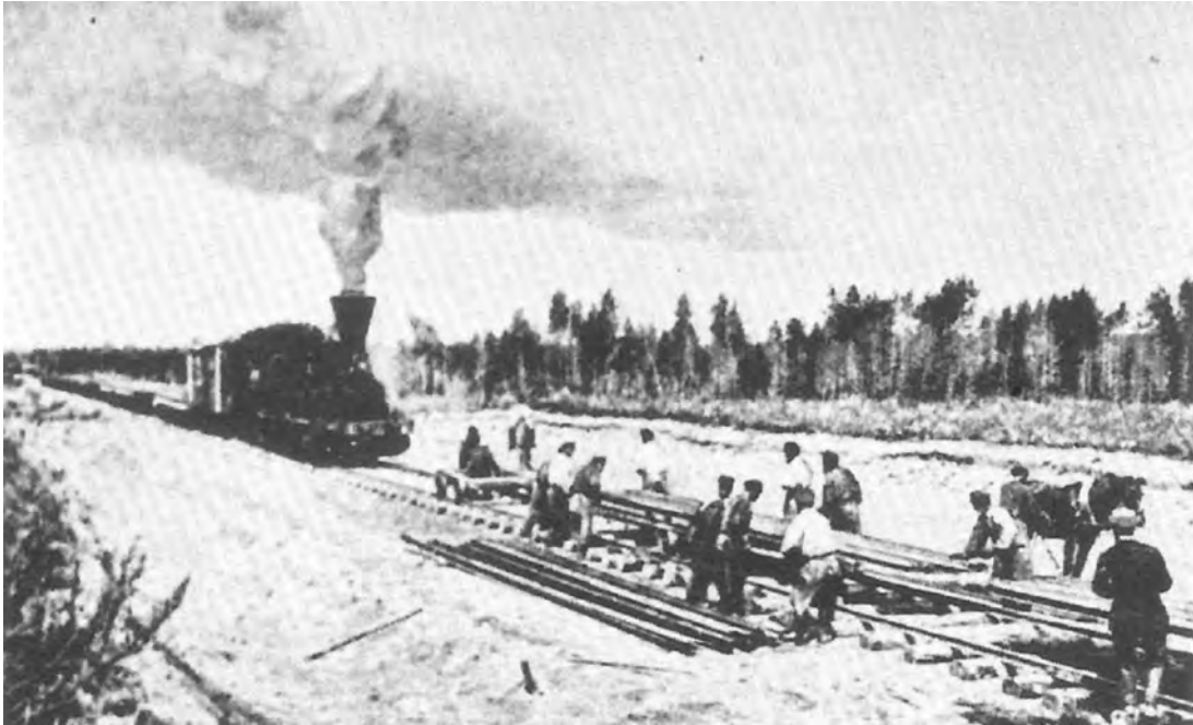
Russian workers laying the final lengths of track for the Trans-Siberian Railway.

3 Look at the picture, and then answer the questions which follow.