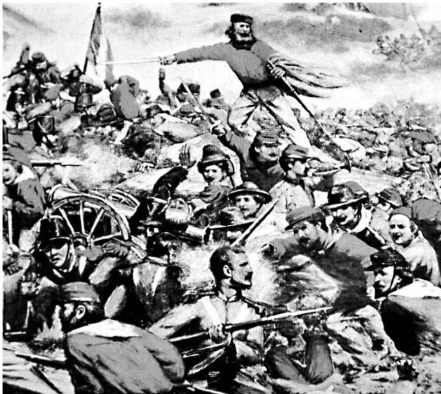
A drawing of Garibaldi at the Battle of Calatafimi in 1860 during the conquest of Sicily.