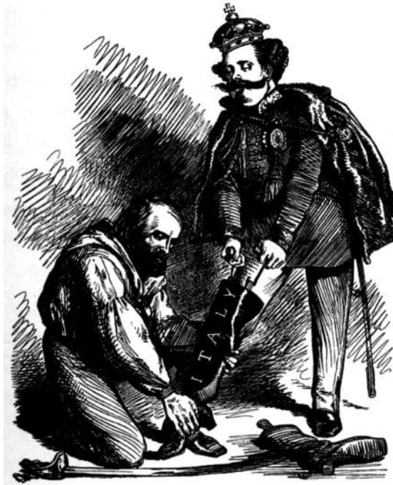
RIGHT LEG IN THE BOOT AT LAST.

“IF IT WON’T GO ON, SIRE, TRY A LITTLE MORE POWDER.”