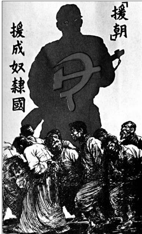
A South Korean poster from 1950 showing what the South Koreans feared would happen to their country.