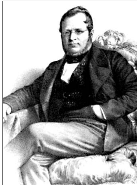
A painting of Cavour.