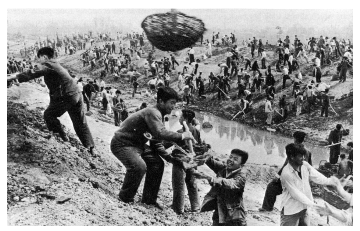
Building a new canal near Beijing during the Great Leap Forward.