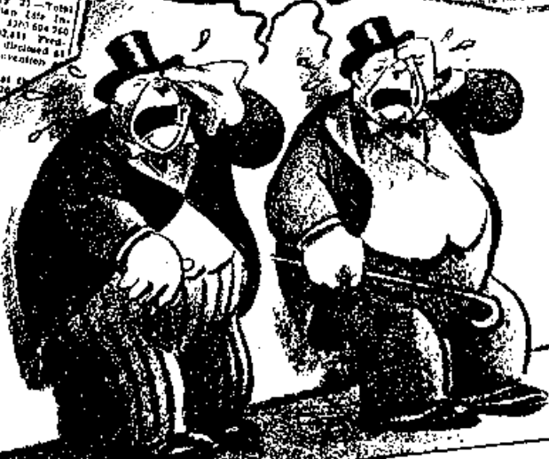
A cartoon published in a US newspaper in 1936.