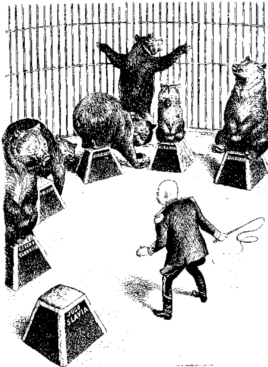
A British cartoon published in October 1956. The man in the centre is Khrushchev.