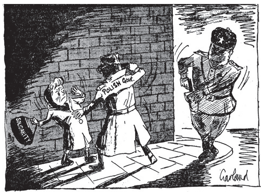
"Excuse me sir - is this lady bothering you?"

A cartoon published in Britain, 5 December 1980. The figure on the right represents Brezhnev.