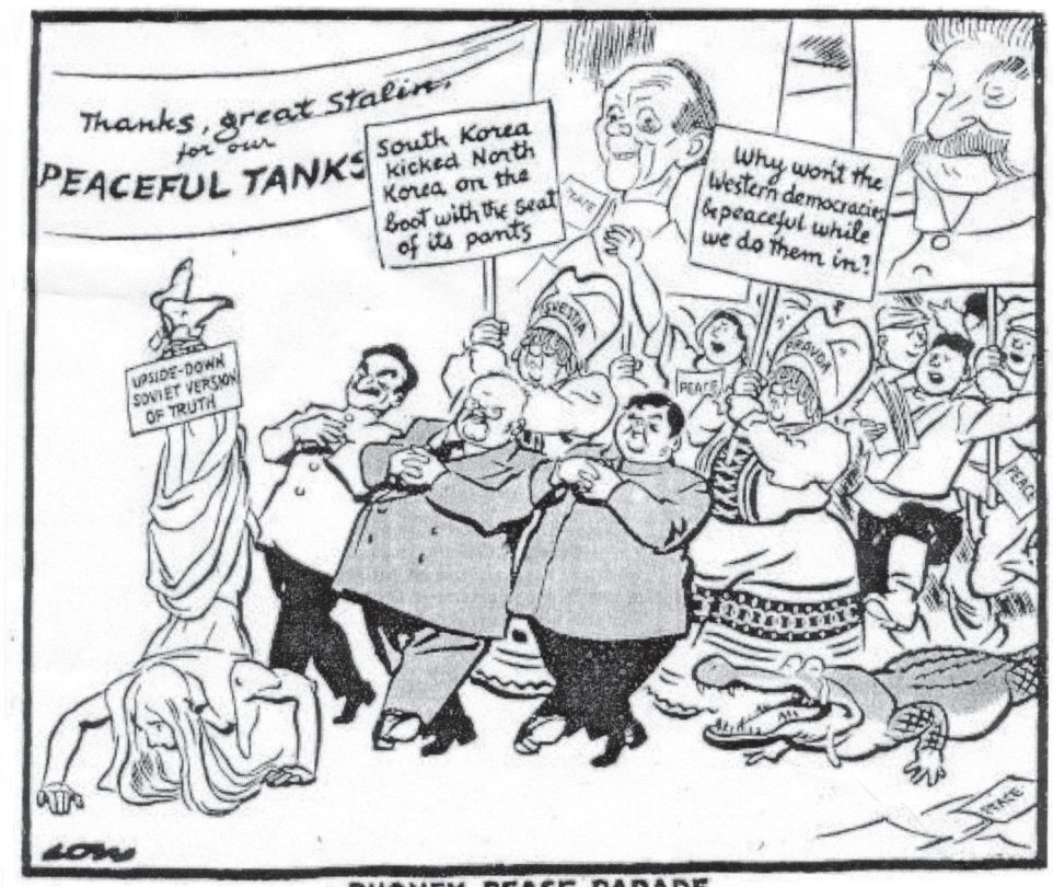
PHONEY PEACE PARADE

A cartoon entitled 'Phoney Peace Parade' published in Britain, 4 July 1950. Britain had asked the Soviets to help bring about a peaceful settlement and they promptly mounted a 'peace' campaign.