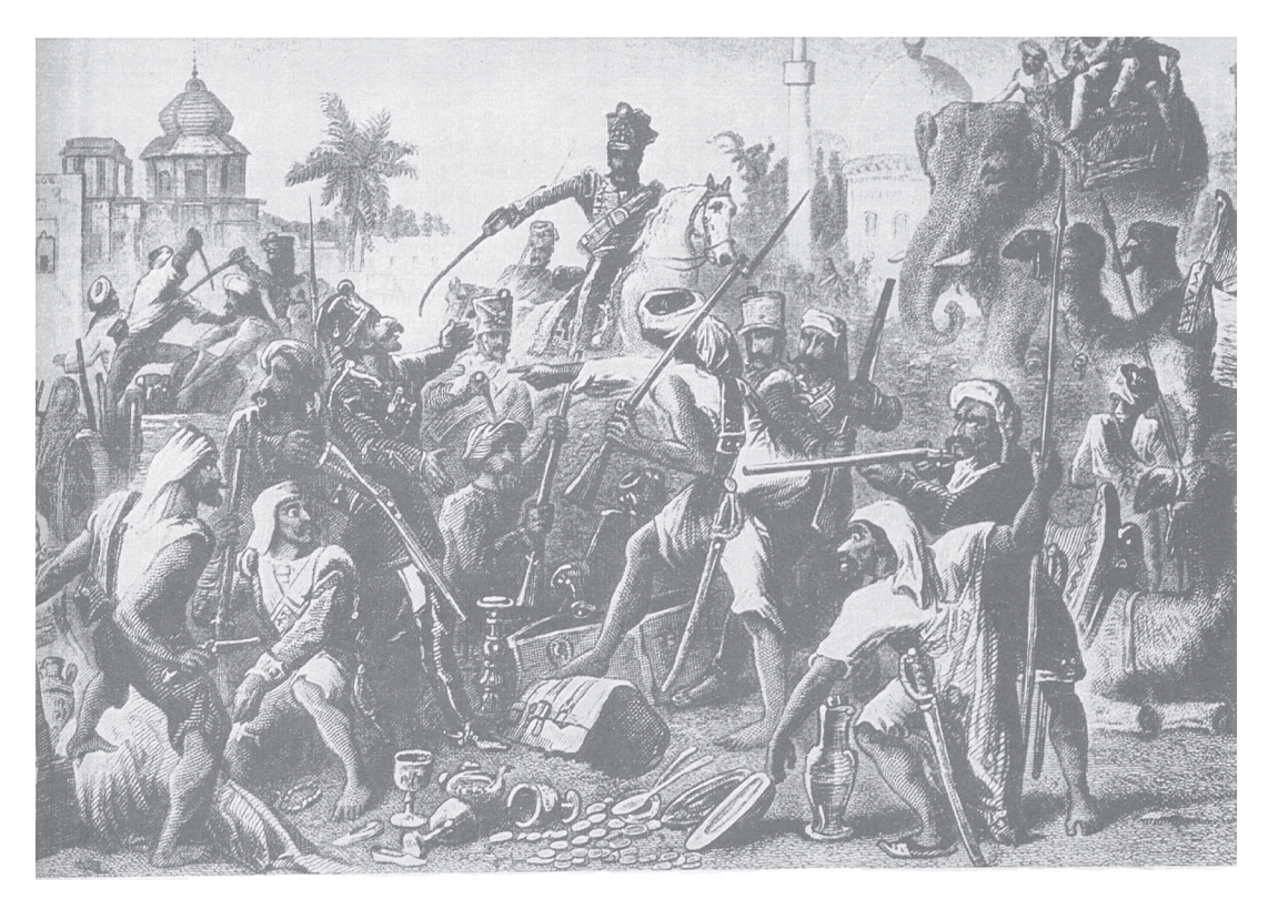
An illustration entitled 'Mutinous Sepoys Dividing Spoils' from 'The History of the Indian Mutiny', published in Britain in 1860. 'Spoils' means the items stolen during the fighting.