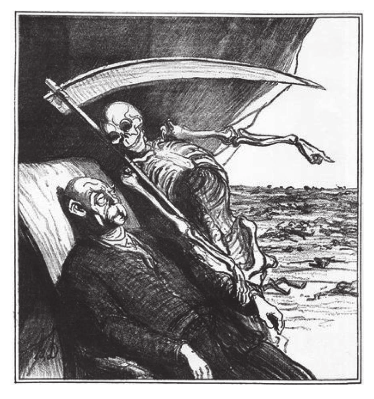
A cartoon published in France in August 1870 showing the war dead. The title of the cartoon is 'News'. The caption under the cartoon said, 'Bismarck's nightmare.' The Grim Reaper is saying, 'Thank you!...'