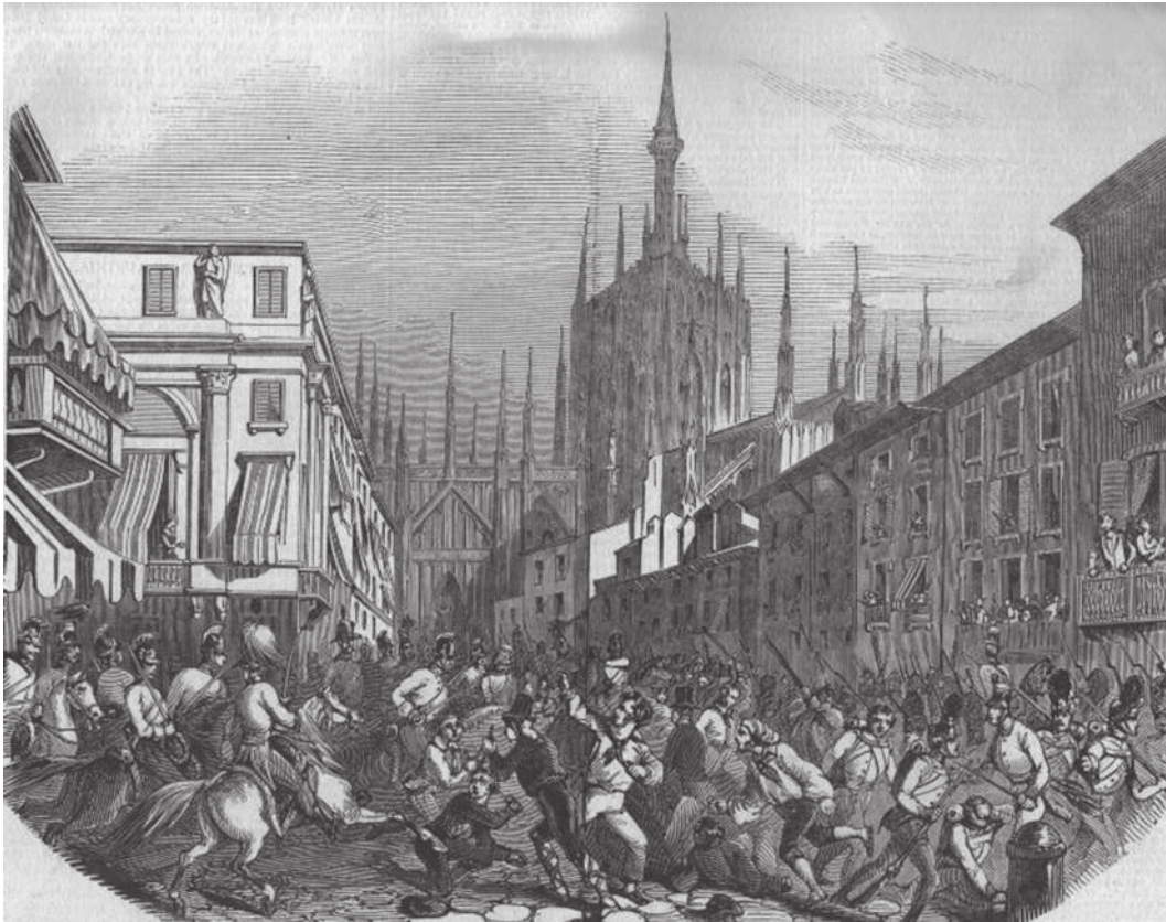
A drawing from the time of the uprising in Milan in March 1848.