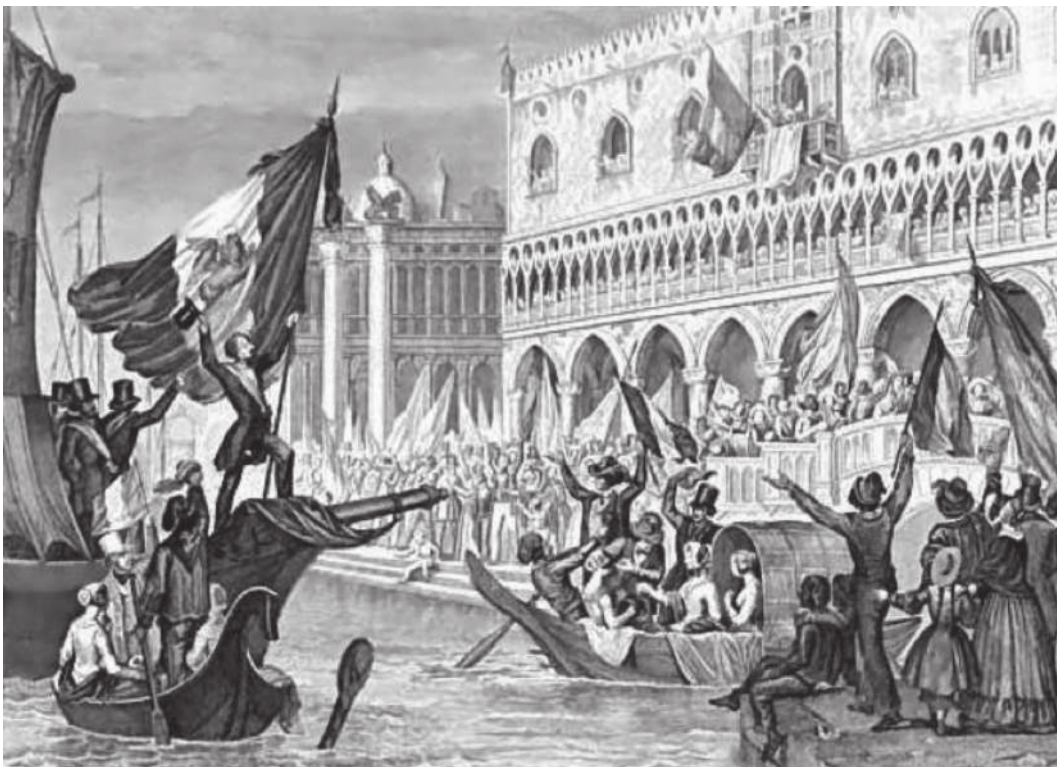
A drawing from the time of Daniele Manin proclaiming the Republic of Venice in 1848.