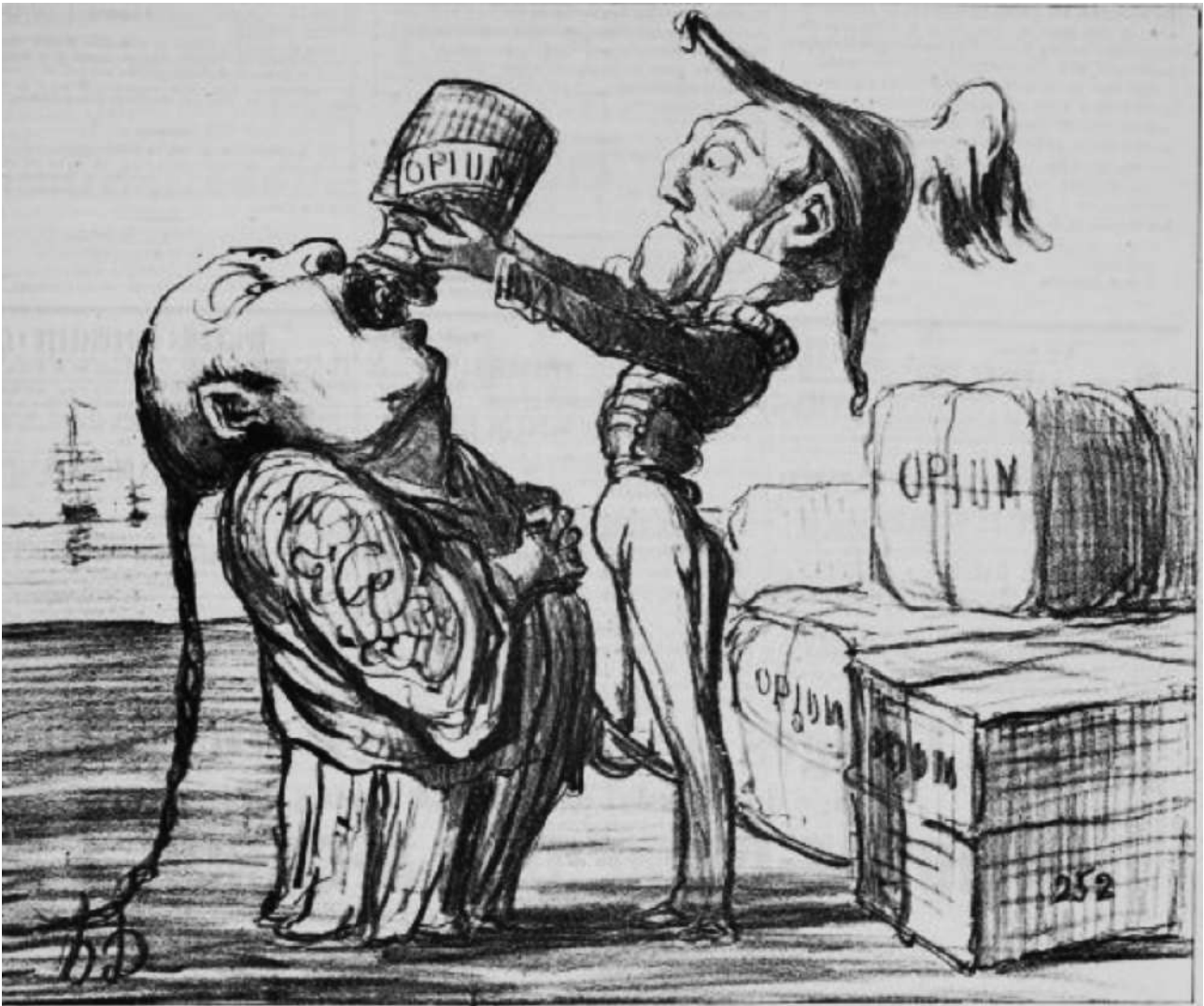
A French cartoon published in 1840. The figure on the right represents Britain.