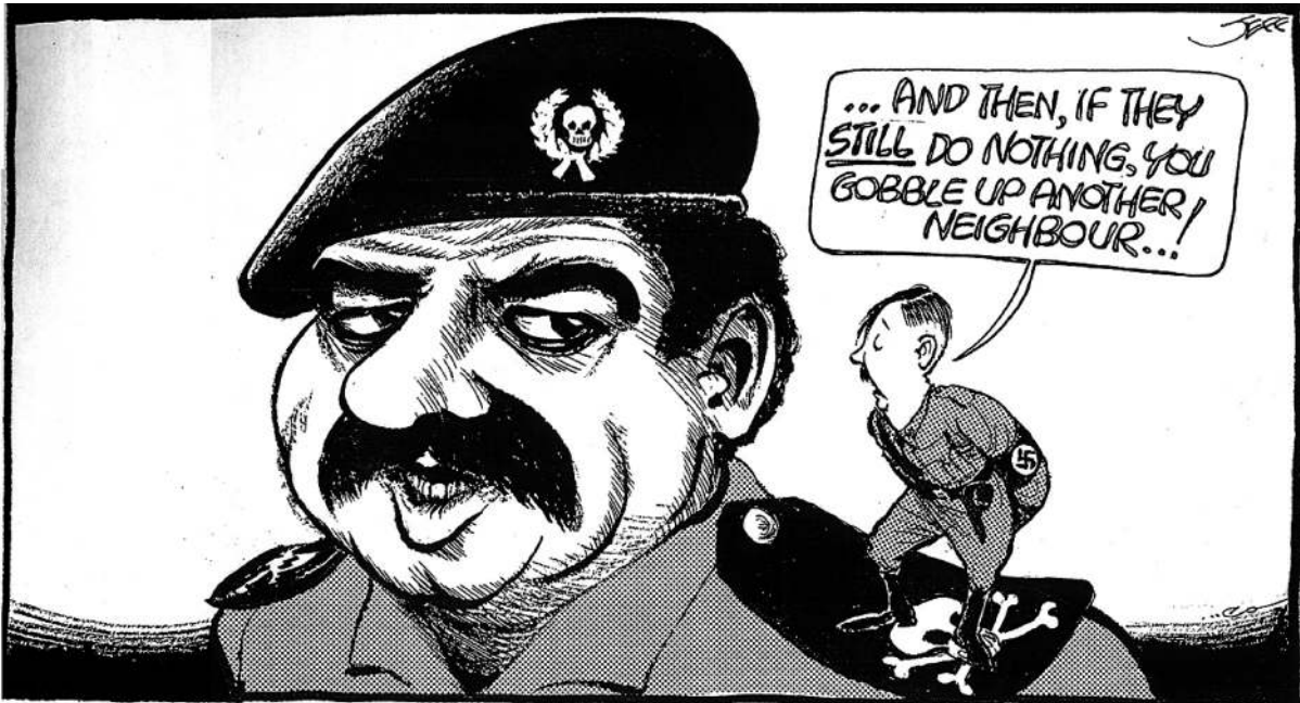
An Australian cartoon, published in August 1990. It shows Hitler on Saddam Hussein's shoulder.