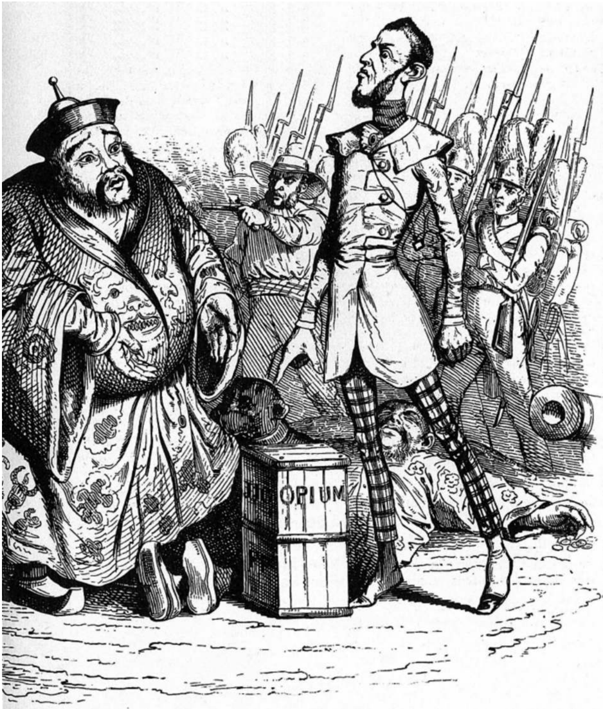
A German cartoon entitled 'English Trade', published in 1840. On the left is Lin Zexu.