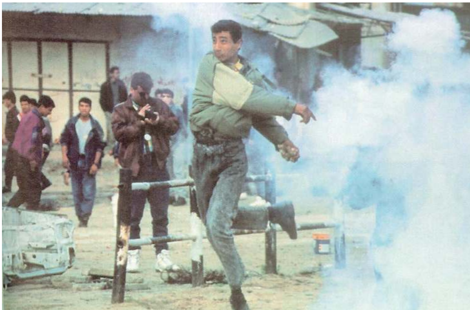
A photograph of a Palestinian protester in Hebron.

21 Look at the photograph, and then answer the questions which follow.