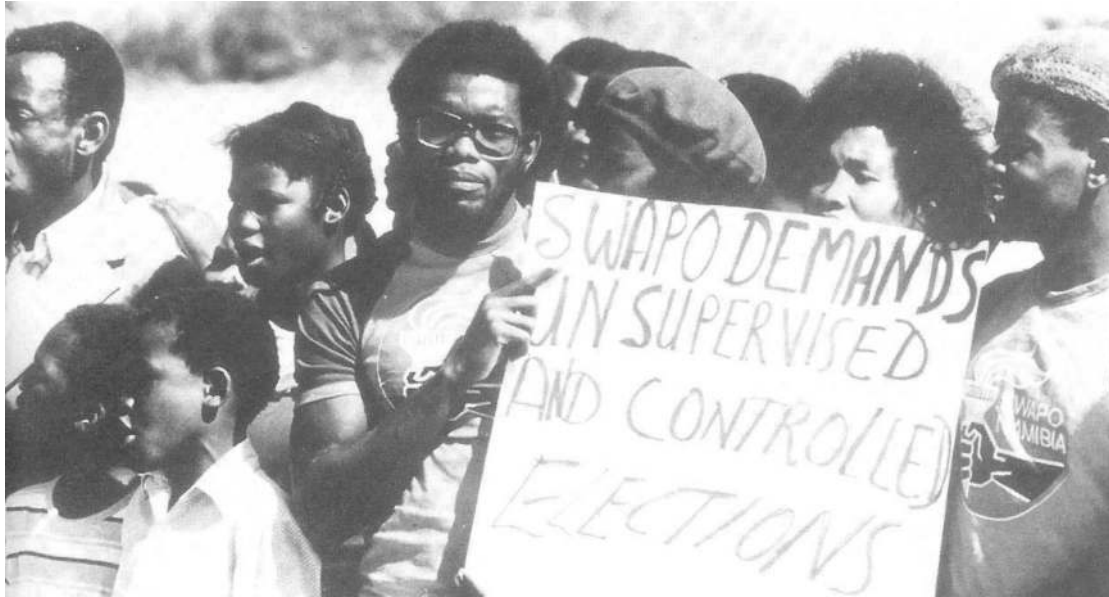
A photograph of a SWAPO protest in 1978.

19 Look at the photograph, and then answer the questions which follow.