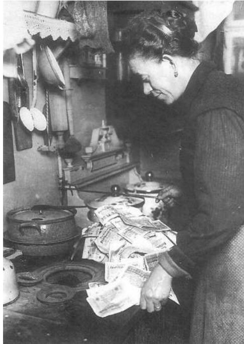
A photograph taken in 1923 showing a German housewife using paper money to light her kitchen stove.