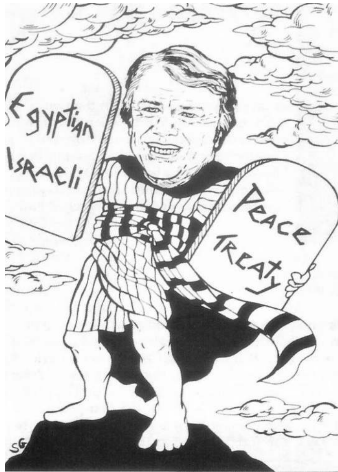
An American cartoon, showing President Carter, published in 1978.

20 Look at the cartoon, and then answer the questions which follow.