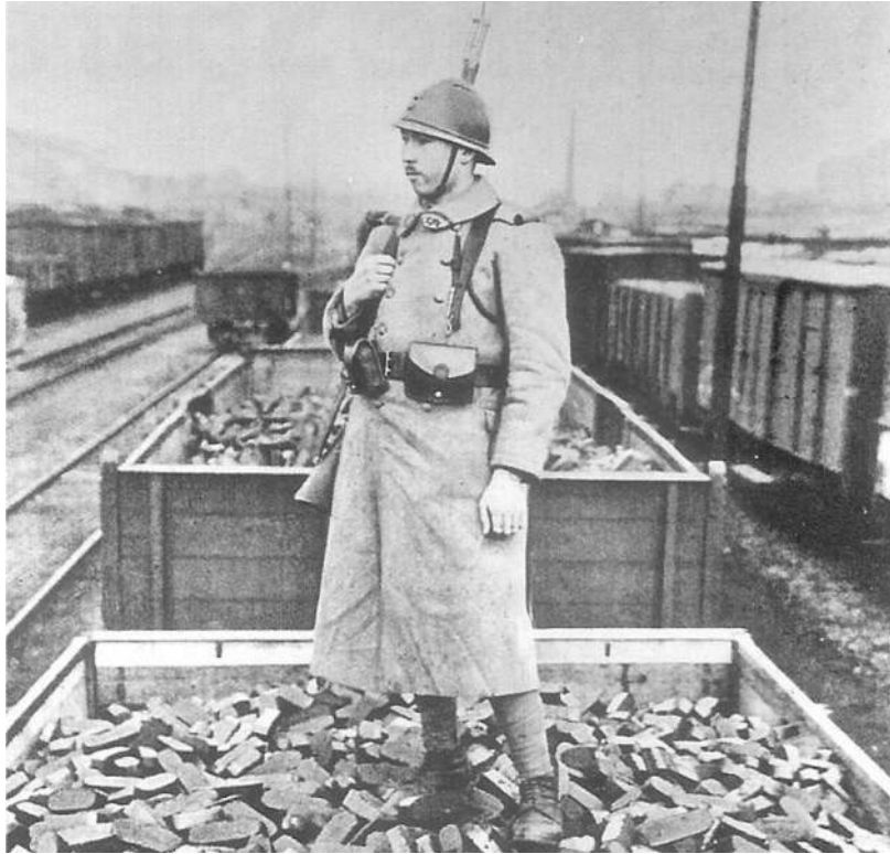
A photograph of a French soldier guarding a train in the Ruhr, 1923.