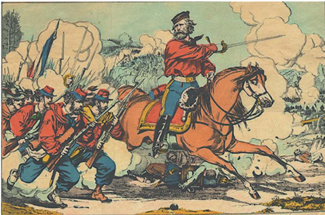
An illustration of Garibaldi and his army of Redshirts.