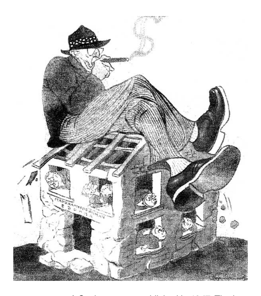
A Soviet cartoon published in 1947. The house represents Europe.