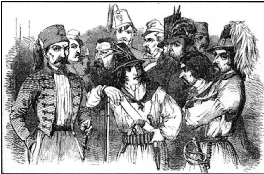
A drawing entitled 'Rome – Garibaldi's Men', published in an English magazine in July 1849.