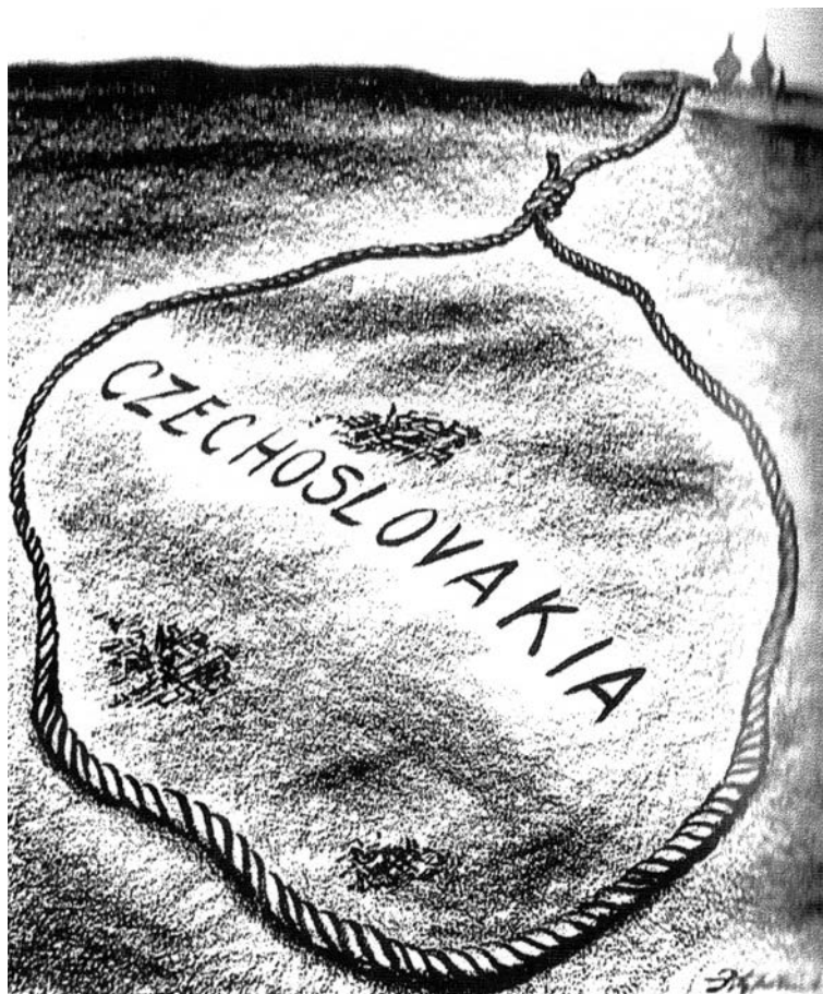
An American cartoon published in 1947. The title of the cartoon is 'When the time is right'.