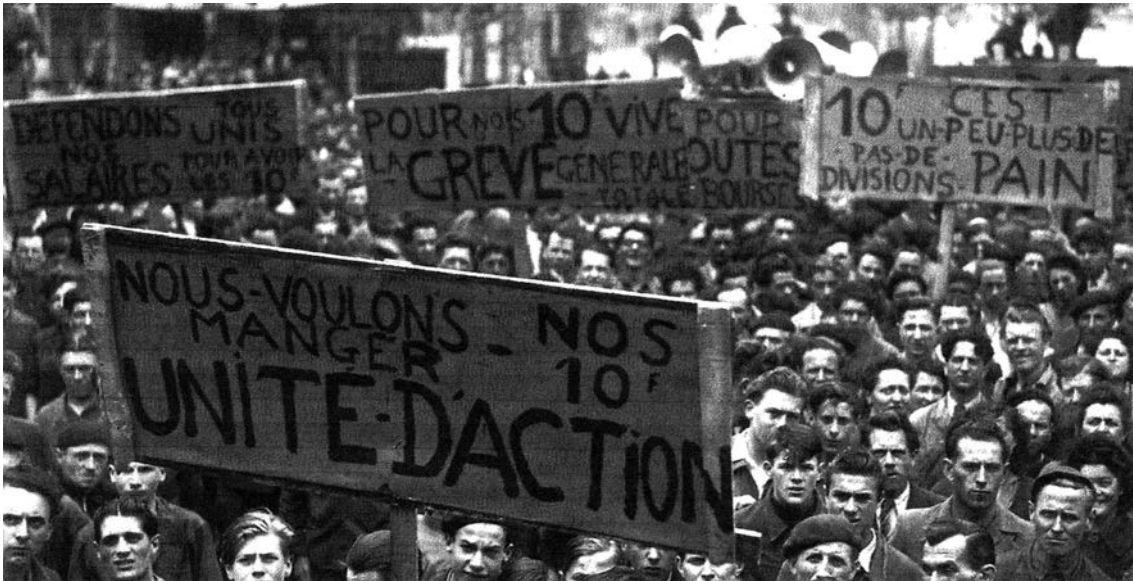
A photograph of workers in Paris demonstrating in 1947 for more pay, more bread and more united action by left-wing groups.