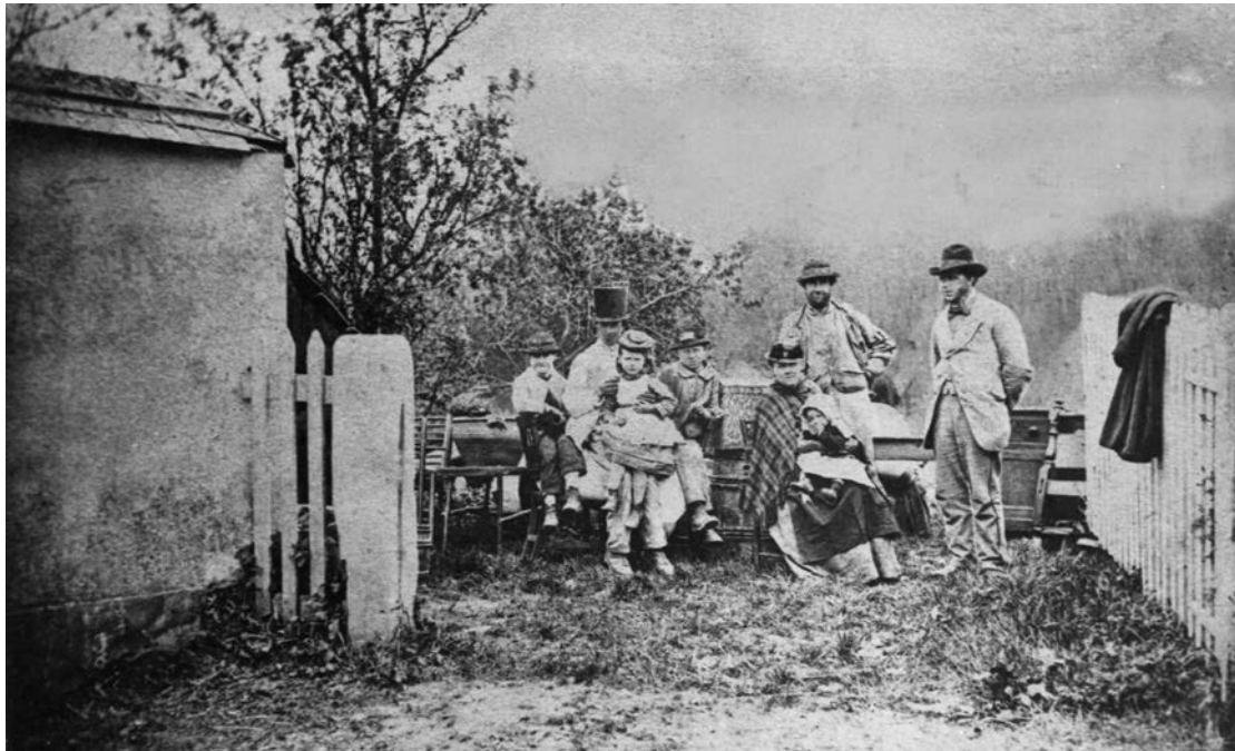
Farm labourers evicted from their home for being members of the National Agricultural Labourers' Union, 1874.

23 Study the picture, and then answer the questions which follow.