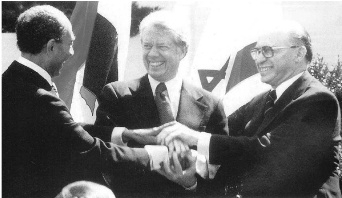
President Carter, President Sadat and Prime Minister Begin after signing a peace treaty in March 1979.

20 Study the photograph, and then answer the questions which follow.