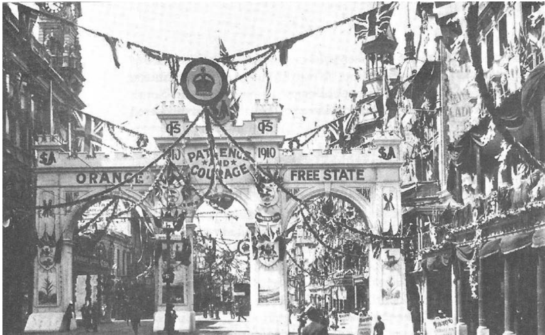
A photograph showing celebrations in South Africa on the creation of the Union, 1910.

17 Study the photograph, and then answer the questions which follow.