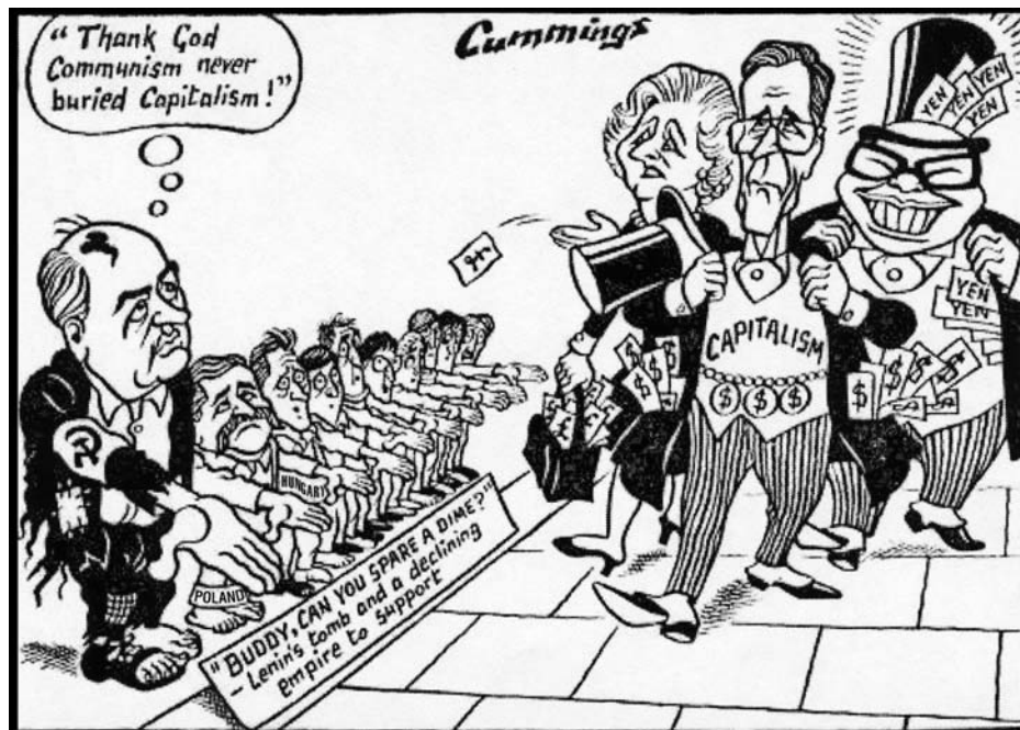
A cartoon published in Britain in August 1989. The figures on the right represent Britain, America and Japan.