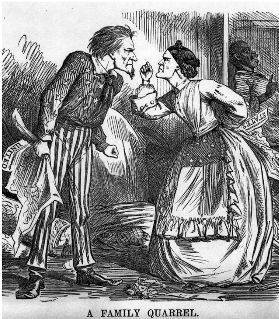
A British cartoon published in September 1861.