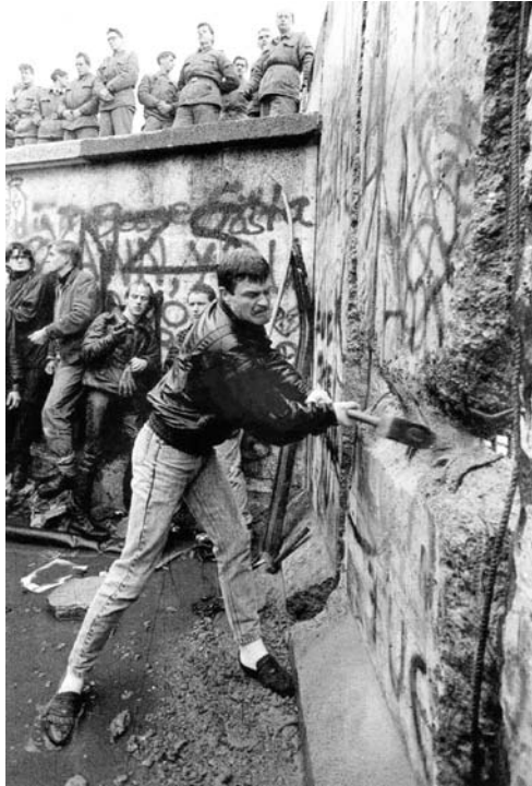
A photograph of events at the Berlin Wall in November 1989.