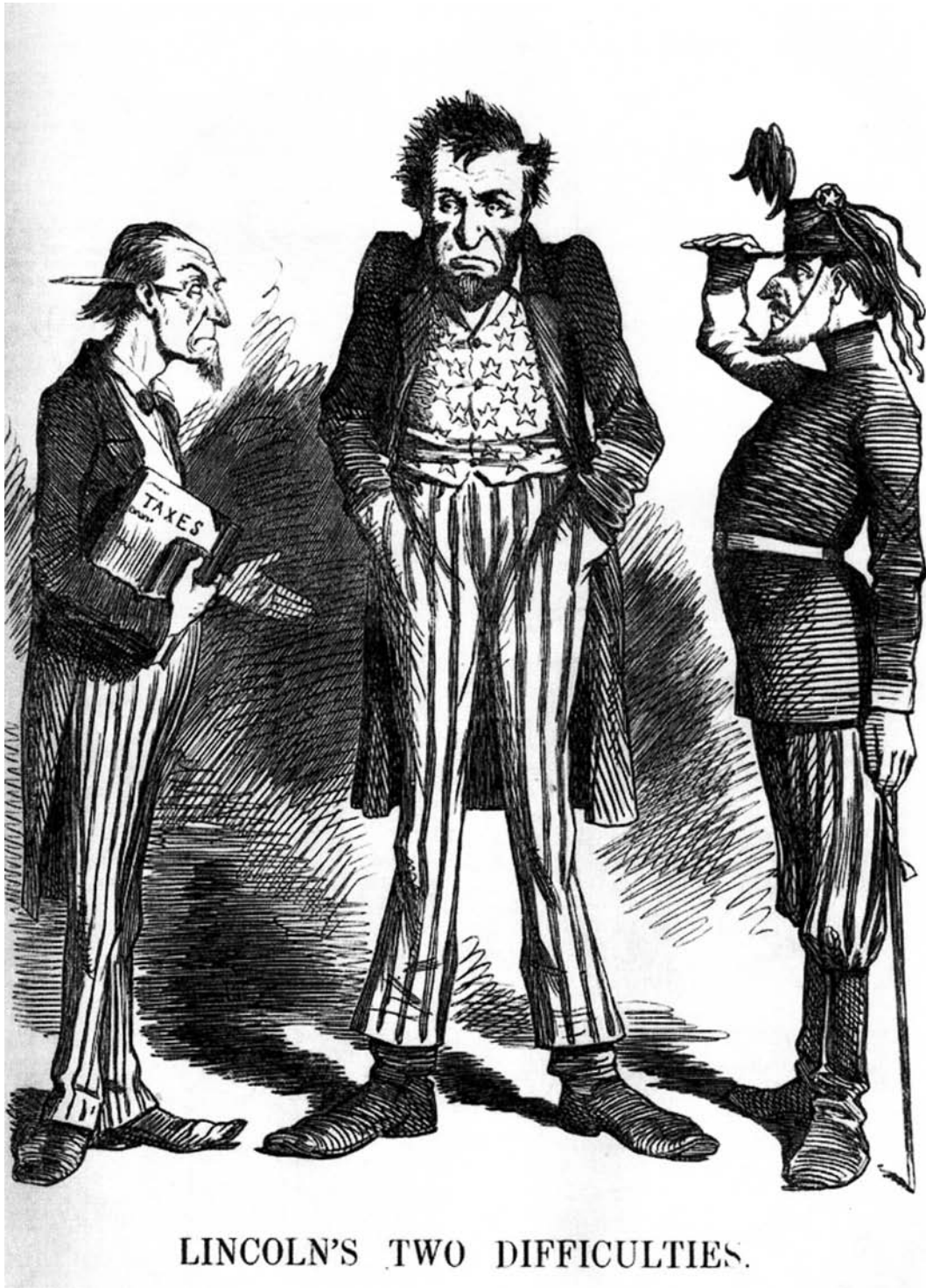
A cartoon from an English magazine, August 1862.