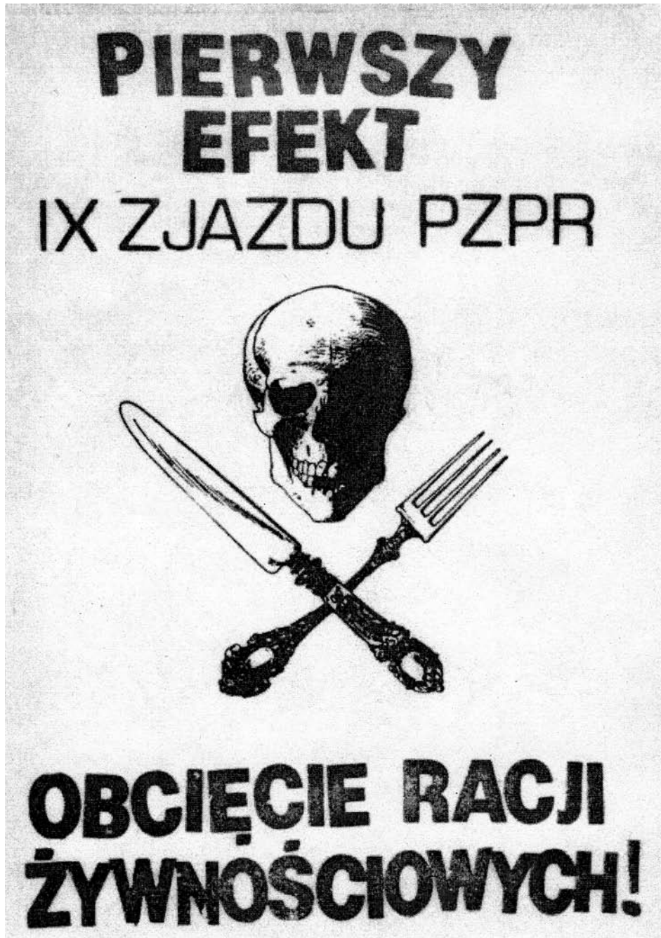
A poster published in Poland in 1981. It says 'The first result of the Ninth Communist Party Congress: a cut in food rations'.