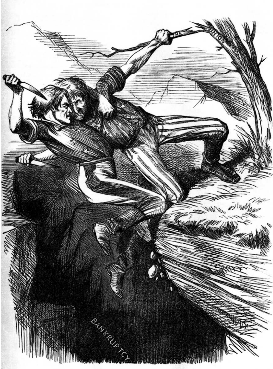
A cartoon from an English magazine, June 1862. The two figures represent the North and the South.