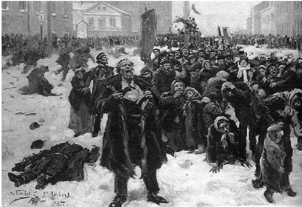
A painting of Bloody Sunday, produced around 1910.

11 Study the painting, and then answer the questions which follow.