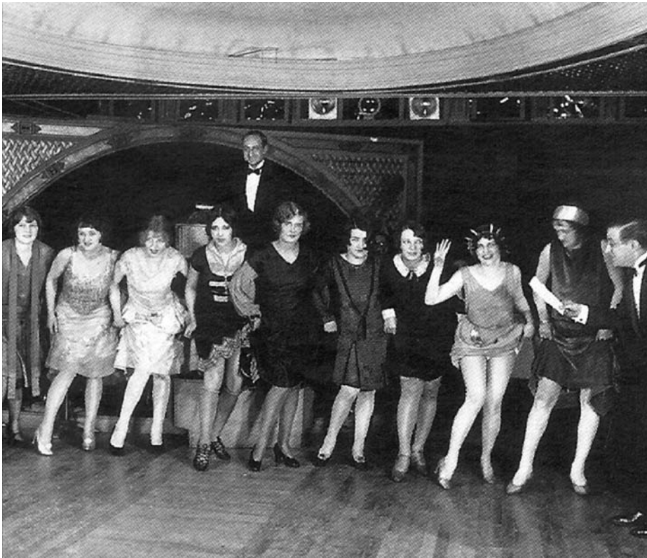
Flappers in the 1920s.

13 Study the photograph, and then answer the questions which follow.