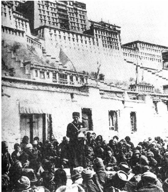
A Chinese Communist leader reads a proclamation to crowds of Tibetans in 1959.

15 Study the picture, and then answer the questions which follow.