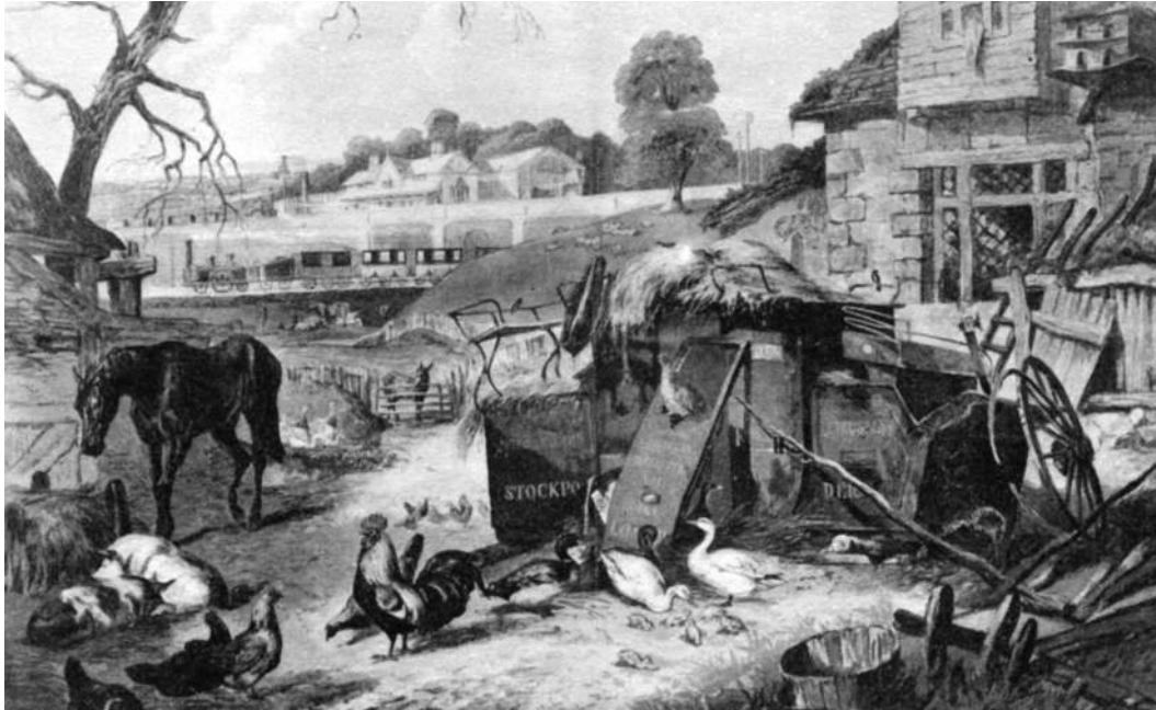
A painting of 1850 called 'Past and Present Through Victorian Eyes'.

The census of 1851 listed 34 306 railway labourers and 14 559 railway officers, clerks and stationmasters. There were also 29 408 horse-keepers, 56 981 carriers and carters, and 16 836 non-domestic coachmen, guards and postboys – not to mention those who maintained and drove the tens of thousands of private carriages and the large numbers of coach-builders, wheelwrights, blacksmiths and saddlers.