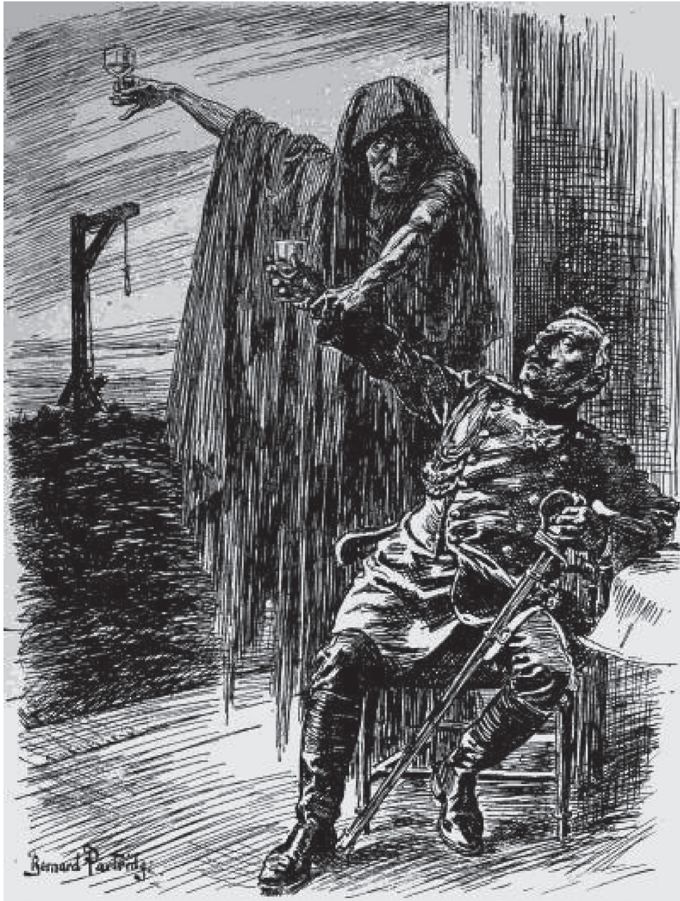
A cartoon published in Britain in 1915. The Kaiser is saying 'To the Day...', but the figure of Death adds the words '...of reckoning!'