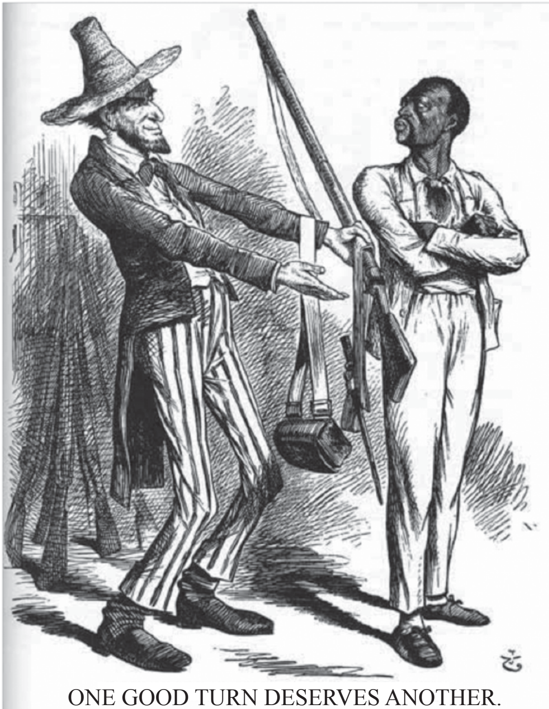
A cartoon published in Britain in August 1862. Lincoln is saying 'Why I do declare it's my dear old friend! Of course you'll fight for us. Lend us a hand old friend!'