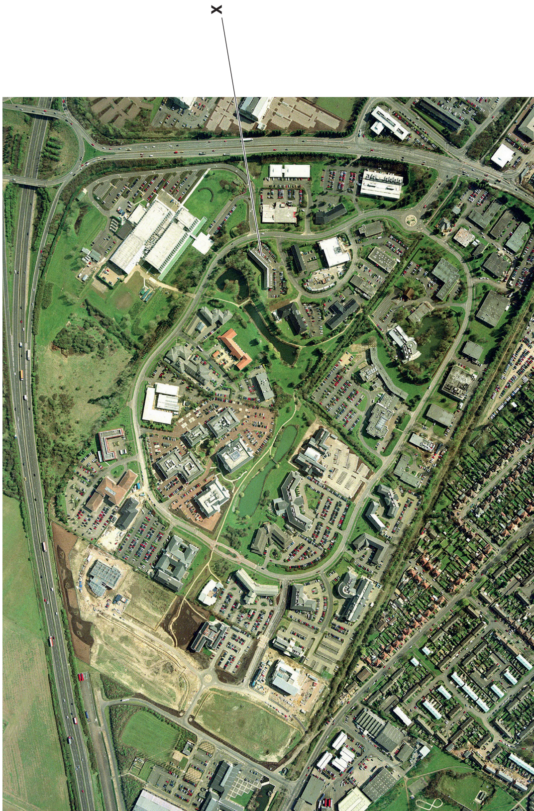
Fig. 1.1 for Question 1 High technology industrial area in 2006